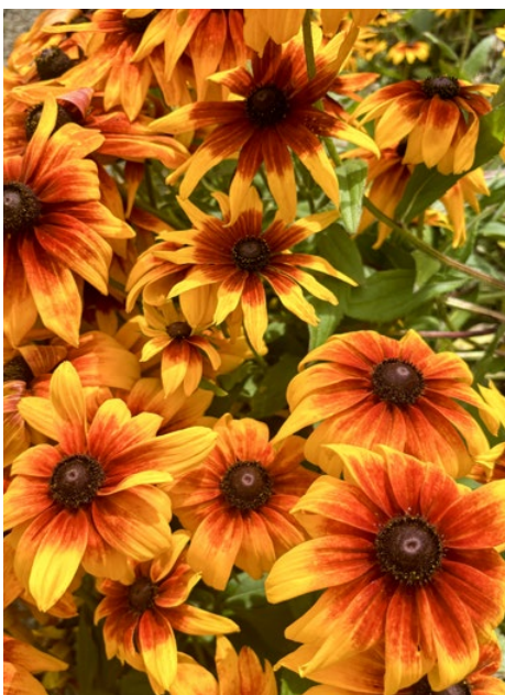
Rudbeckia hirta seedling in the Keiller Garden.