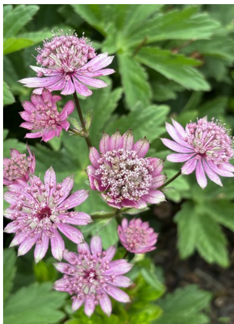
Astrantia major in The Lodge border.