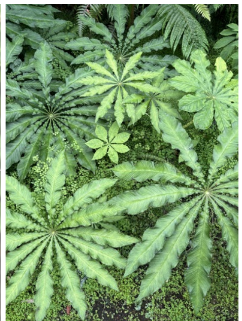
Arisaema taiwanensis in the Vireya House.