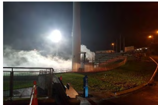
Yarrow Stadium light-tower fire September 2017.

This work essentially restores what previously existed, with essential updates.