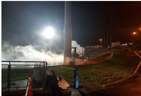
Yarrow Stadium light-tower fire, September 2017

Reference: Consultation Document ( www.bit.ly/YarrowCD )