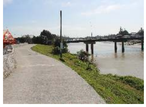
New riverside pathway upstream of the Town Bridge at Waitara.

A one-in-100-year flow in the Waitara River is estimated at around 3,800 cubic metres per second which is more than twice the highest flow measured at 1,640 cubic metres on 20 June. A one-in-100-year flood would be about 2.5 metres higher, with a substantially higher flow velocity.