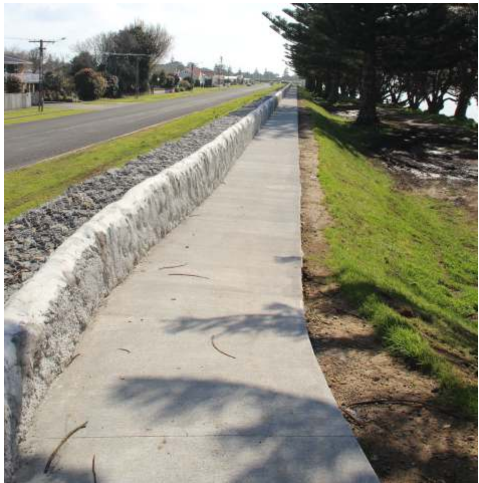
The upgrade at Waitara is resulting in a continuous riverside pathway almost to the sea.