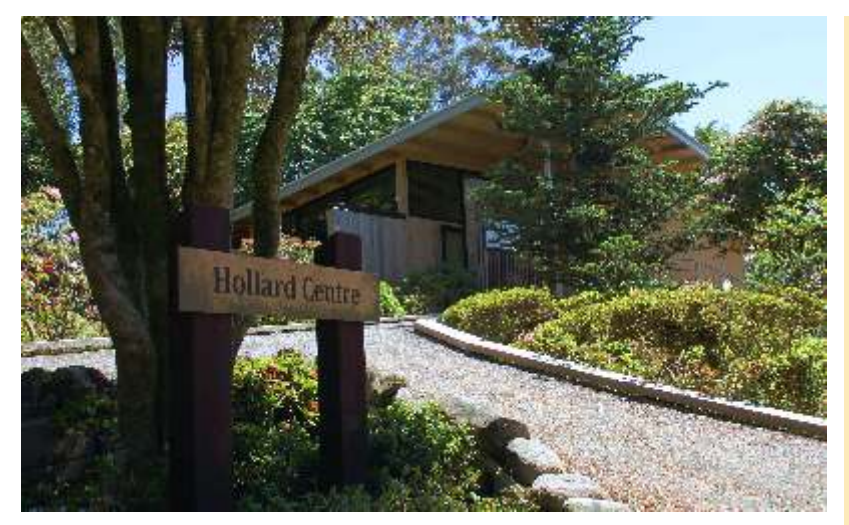
'A pavilion of natural materials which nestles into the surrounding natural environment ... '