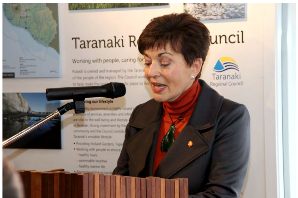
The Governor-General, Dame Patsy Reddy, addresses guests at the formal opening of the Rainforest Centre at Pukeiti.

Centre would be an important waypoint in a promising new regional venture – the proposed Taranaki Crossing.