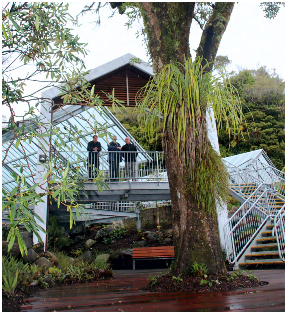
Visitors admire the view out over the garden and down to the coast from the rear of the Rainforest Centre.