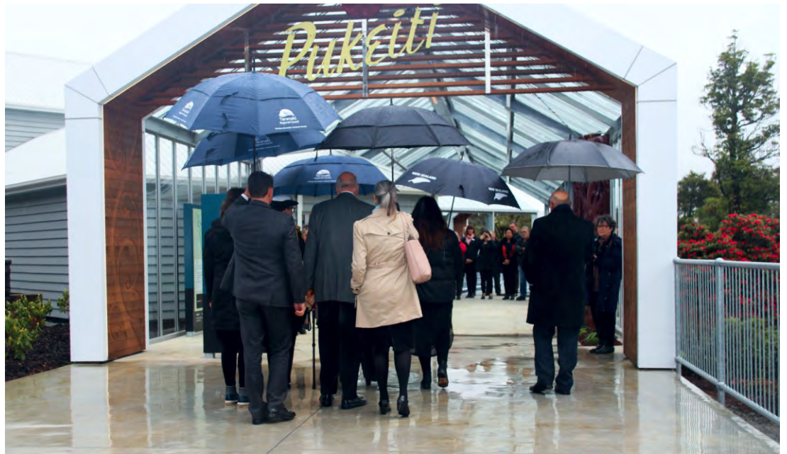
The Vice-Regal party is welcomed into the Rainforest Centre for the formal opening ceremony.

And he says Pukeiti and its new Rainforest