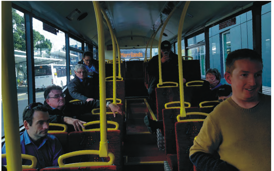
Higher patronage would help to bring about change and further improvement to our bus services.

He says smaller buses are not practical as it's more efficient and better value for money to operate one bus all day, rather than swapping between two smaller buses to meet fluctuations in passenger numbers.