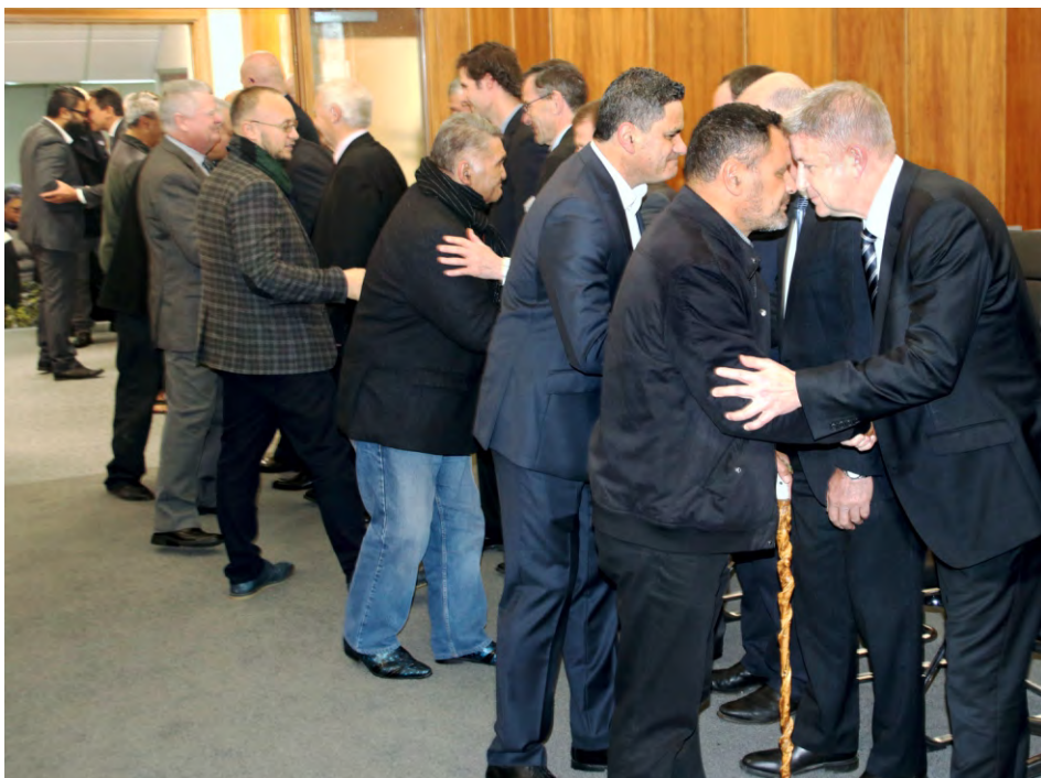
The new Iwi representatives and their supporters are welcomed by Council staff at the pōwhiri.

They were all formally welcomed to their new roles with a pōwhiri earlier in August.