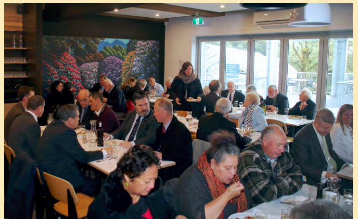
Guests enjoy a meal at the Founders Café after the opening of the Rainforest Centre in early September.