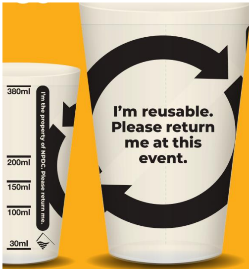
Cups with two return messages, one on each side

The cups are designed to support return for a refund at the bar, or into labelled drop bins at exits. Note these cups could also be loaned out for other events in the region, including by the other two councils, with a per cup wash fee on return.