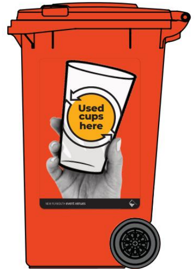
Return bins used at exits