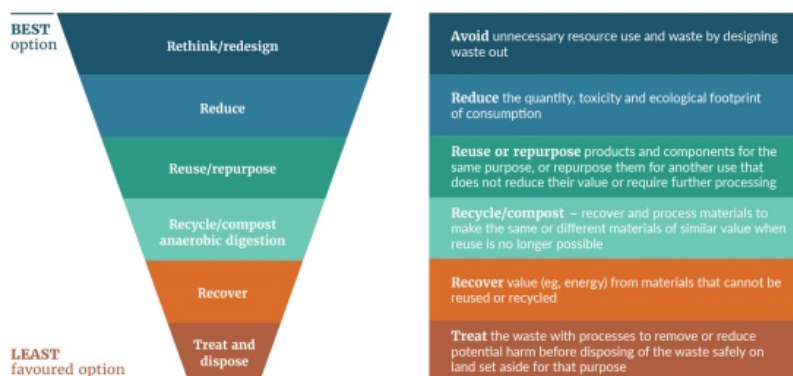
Figure 1: Waste hierarchy