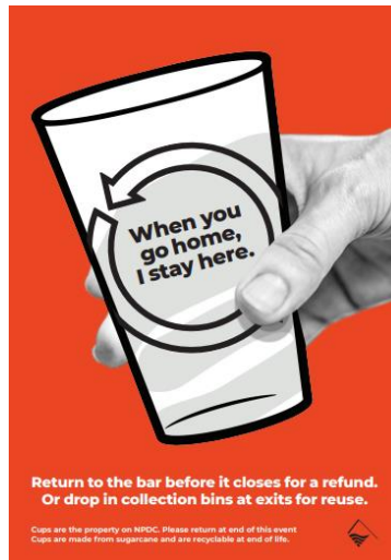
Posters displayed in toilets promoting return of cups