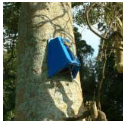
Possum master kill trap

There are many types of kill traps on the market. The Possum Master (see photo) is a very effective kill trap. The snared animal dies very quickly by strangulation. The advantage over leg-hold traps is that kill traps don't require daily checking and are easy to set.