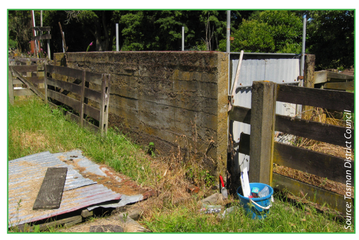
Rectangular shower dip with sump (under corrugated iron)

arsenic if they are collected from surface water downstream of a sheep dip or from a bore located within 300 metres of a sheep dip. Meat, eggs and vegetables raised on a sheep dip site are potential sources of human exposure to arsenic. Eating wildfoods (freshwater mussels, koura and watercress etc.) collected downstream from a sheep dip may also be a source of arsenic exposure. Mushrooms and edible plants (e.g. puha) or ferns should not be collected from the vicinity of a sheep dip.