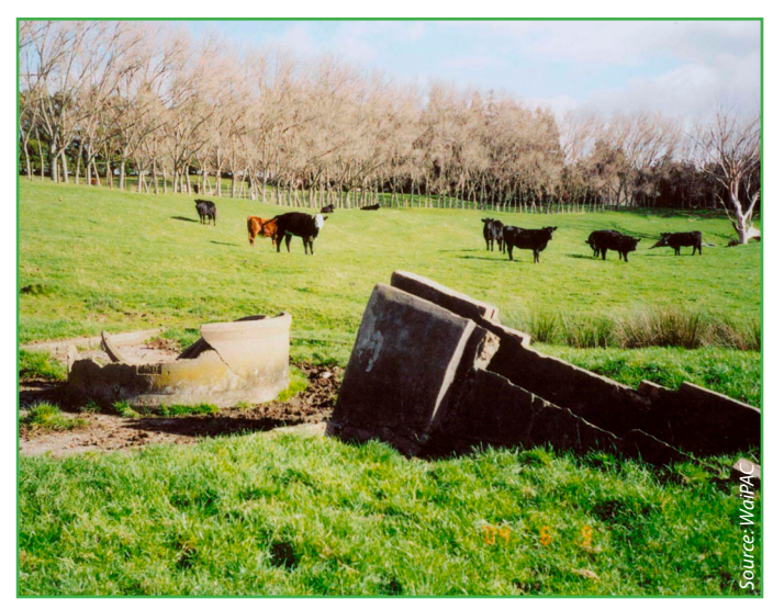
Outline of former plunge dip

Regional Councils are able to apply for Government funding to assist with the remediation of contaminated land, which will provide part of the costs if an application is successful.