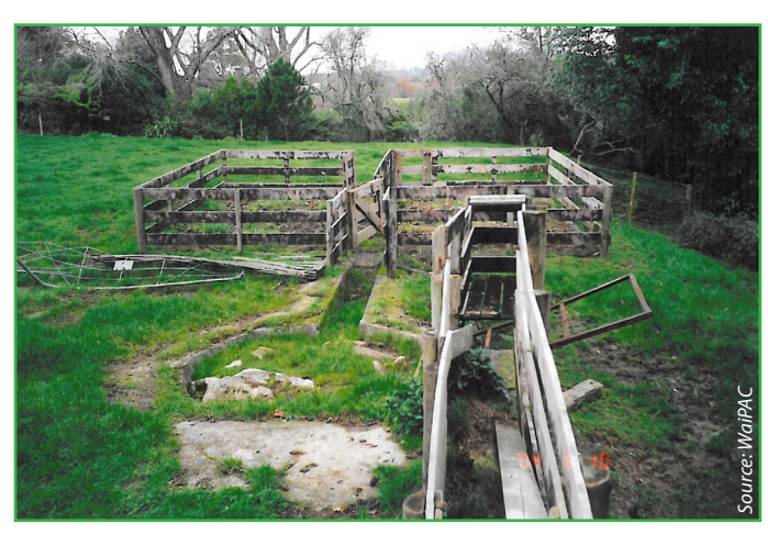
Race, yards and pot dip remains

significant soil and water contamination at most sites. Common practices for removing spent liquids and sludges from dips included gravity drainage to lower ground, pumping or bucketing liquid from the sump and shovelling of residual sludge onto a 'scooping mound'. The accumulation of contaminants from repeated dipping events during a season and year-to-year dipping operations produced highly contaminated soil around the discharge or dumping zone(s). Spent dip solution and sludge were often discharged into gullies, streams and the foreshore for ease of disposal. Storage of dipping chemicals or containers in barns or wool sheds may also have led to soil and water contamination.