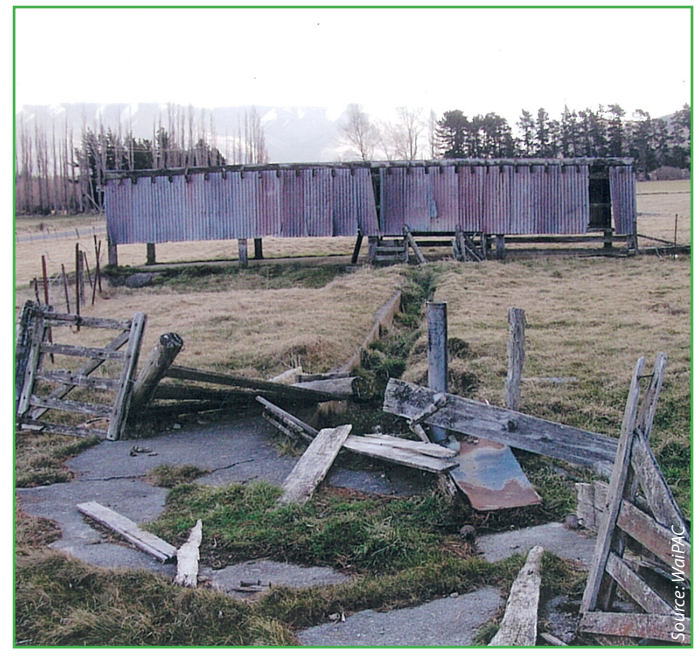
Swim through dip

Occupiers and landowners are required to take all practical steps under the Health and Safety in Employment Act 1992 to 'eliminate, isolate or minimise' any hazards to ensure the safety of their employees and contractors working on or around dips, including during any remediation activities. Landowners and occupiers also have a responsibility to ensure non-work related people, including children and visitors, do not come to harm from the dip site. Accidental drowning has occurred at a plunge dip and personal injury has been known to happen from falls and trips around dips sites. Some dip sites are situated in 'amenity land' - areas of public land or public access (e.g. camping grounds) and owners and occupiers need to ensure visitors and residents are not exposed to unnecessary risk.