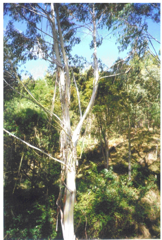
Figure 3 Eucalyptus oreades - an attractive ash group species - bark is an important identification characteristic

Note: This regime has proved to be expensive and results are inferior to a euc/pine mix.