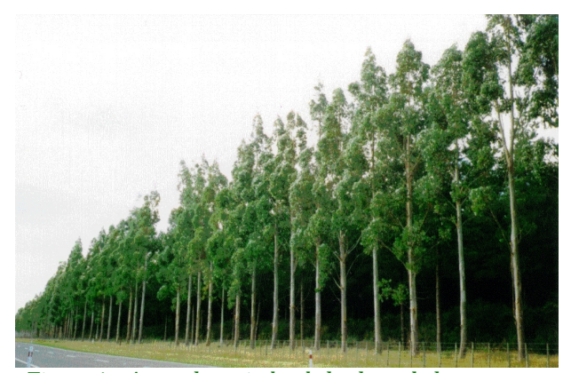
Figure 1 A eucalypt timber belt planted along an exposed roadside to screen a pine forest

The costs of growing and transporting container grown seedlings are much higher than for barerooted seedlings. This method is used for species not easily raised as bare-rooted stock, establishment of seedlings outside the normal planting season, or filling small orders for farm, amenity plantings, or research trials. On unfavourable, droughty, exposed or low fertility sites (which are the norm in erosion control planting) container grown stock give greater survival and early growth rates, and is preferred in many situations. Container grown stock can also be planted out of season if necessary to avoid frost problems.