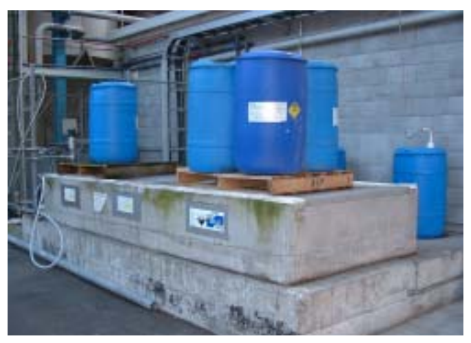
Photo 1: Large quantities of chemicals should be stored in bunded areas

A bund lets you detect and control any small or slow leaks and will contain spills from sudden ruptures of tanks and drums.