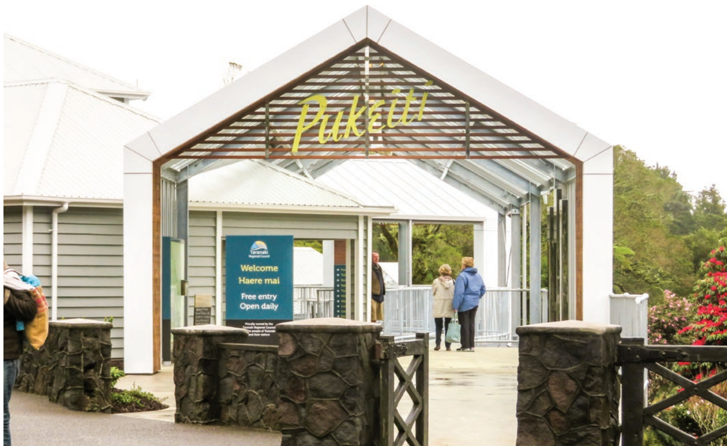
Entrance to the Rainforest Centre