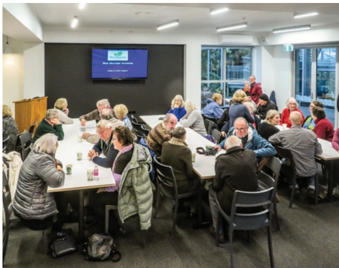
Interior of The Rata Room : First Lecture