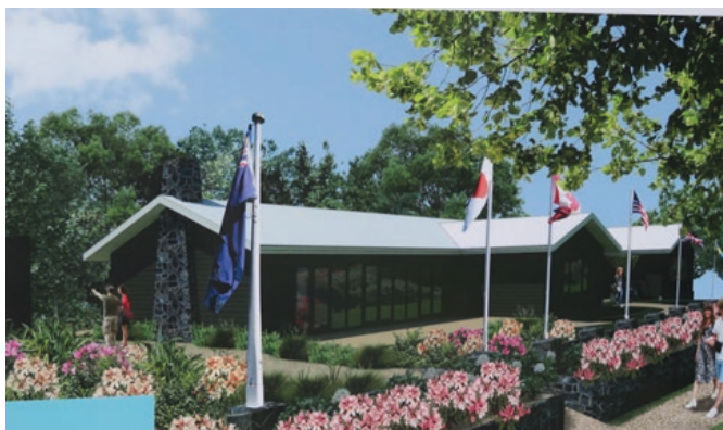
The proposed new Lodge.