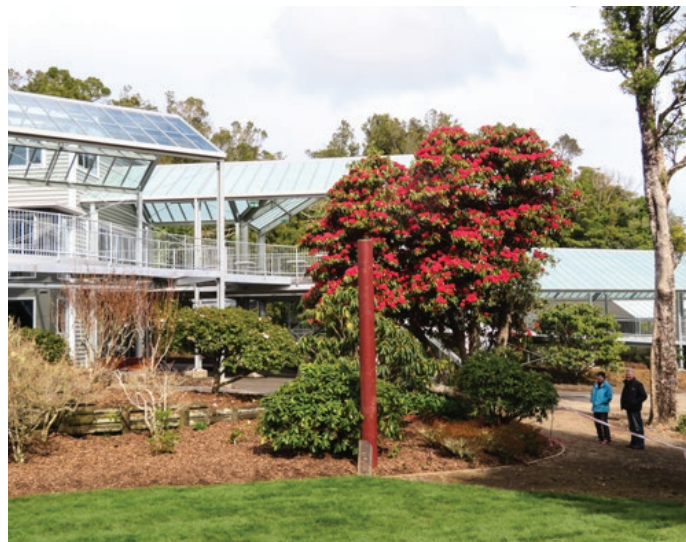
Rhododendron arboreum and the new buildings from the Founders' Garden

fill the space with a variety of companion plants complementing the vireyas which will soon dominate. Many of the plants at this stage are small – propagated from the original larger plants in the old Covered Walk. Already some are in flower.