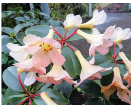
R. 'Dawn Chorus'