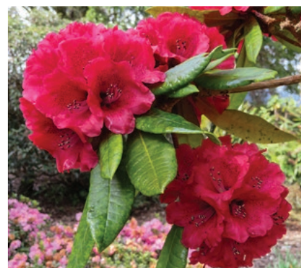
R. 'Sir Russell Matthews'

Rhododendrons named to honour early members