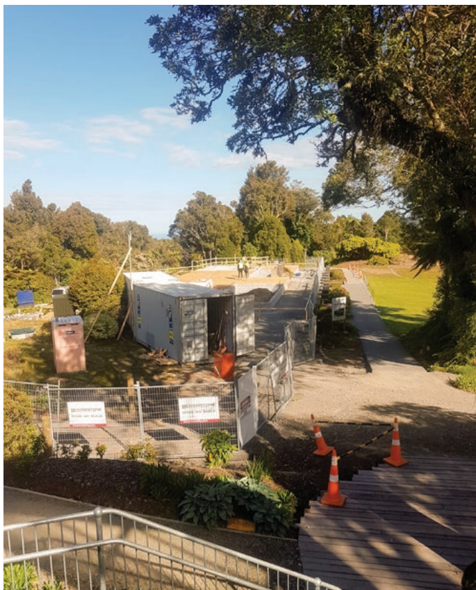
The Lodge foundations are laid