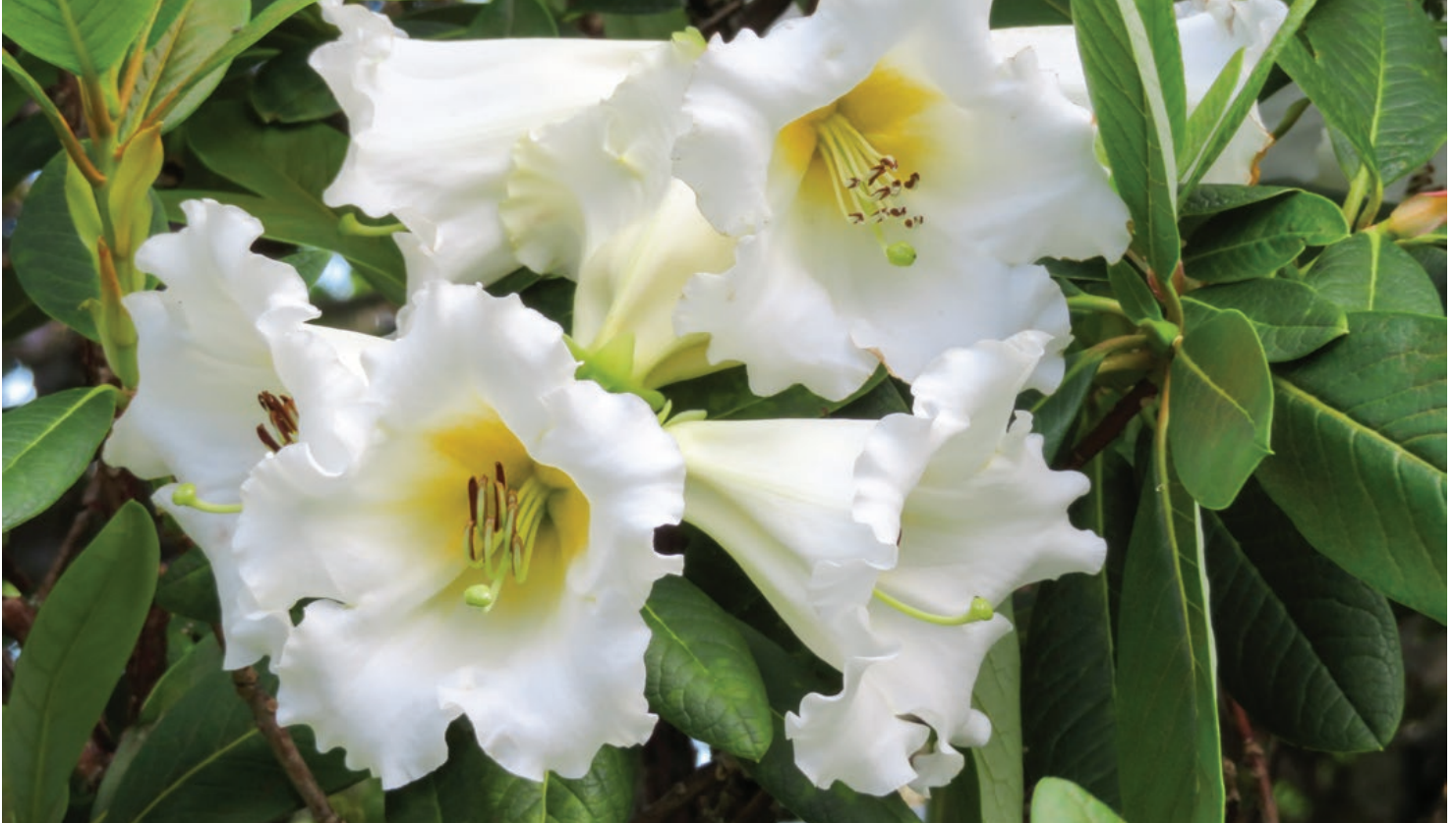
R. 'Eric's Triumph'