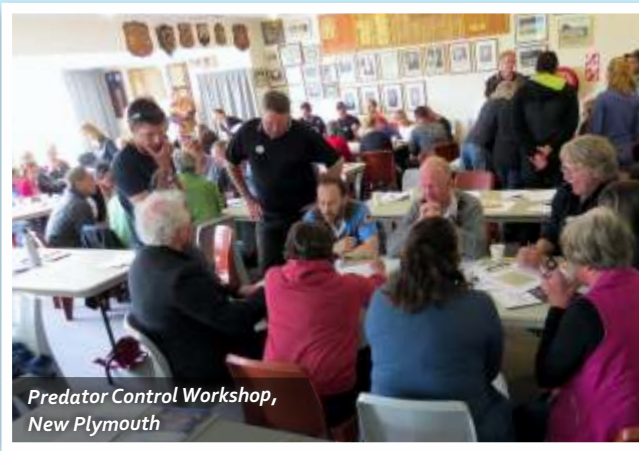
Predator Control Workshop, New Plymouth