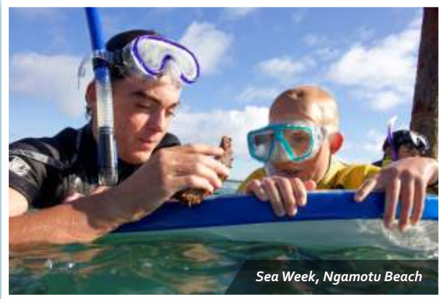
Sea Week, Ngamotu Beach