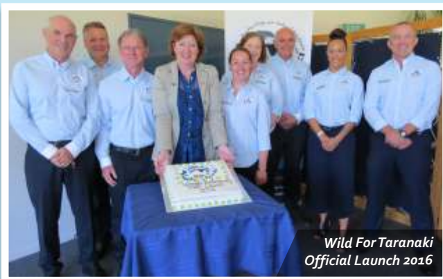
Wild For Taranaki Official Launch 2016