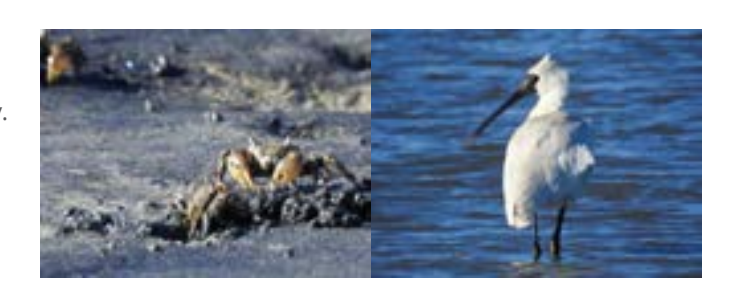
Tunneling mud crabs (Austrohelice crassa) on an intertidal mudflat (top left); a royal spoonbill (Platalea regia).

Vulnerability to eutrophication effects was 'moderate to high' for three estuaries, the Whenuakura, Oakura and Katikara. The latter two were the only estuaries where symptoms of eutrophication, in the form of phytoplankton blooms, were recorded. Other estuaries, such as the Whenuakura, were considered susceptible to eutrophication due to large areas of intertidal habitat which can support macroalgal blooms, high catchment nutrient loads, and where they were poorly flushed or restricted at the mouth.