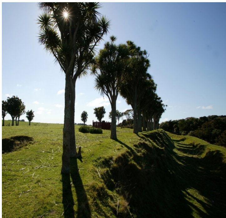
The Turuturu Mōkai reserve is situated on Turuturu Road, Hāwera. Originally the site of three pā grouped together, the area had a population of about 400 people.

All three district councils are currently renewing their archaeological site records as part of a review or change to their district plans.