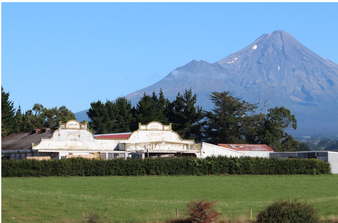
The Ngāere dairy factory, founded in 1814, became well known for its 'Triumph' brand cheese.