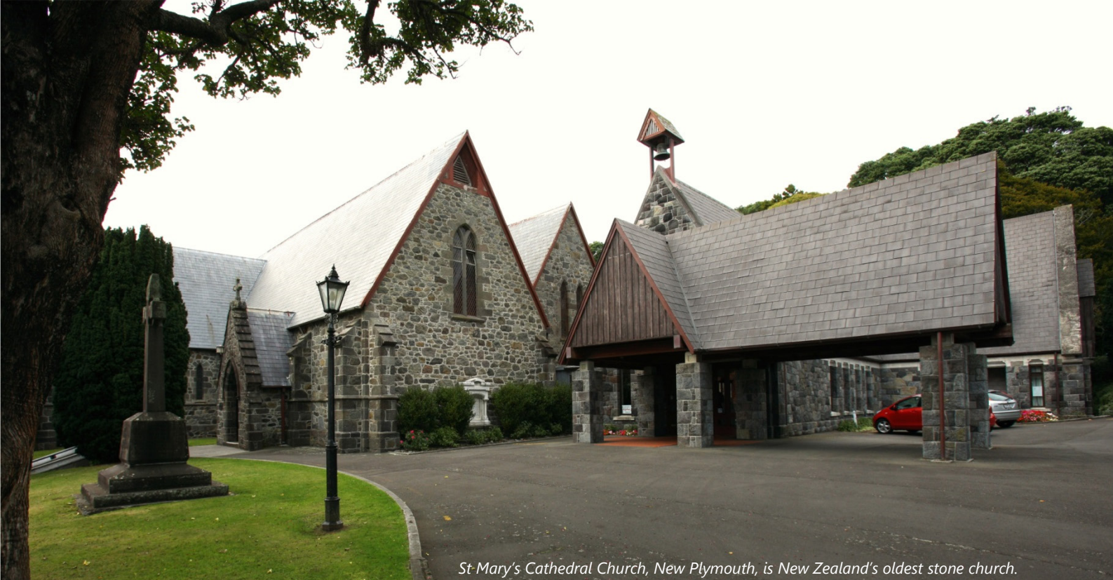
St Mary's Cathedral Church, New Plymouth, is New Zealand's oldest stone church.