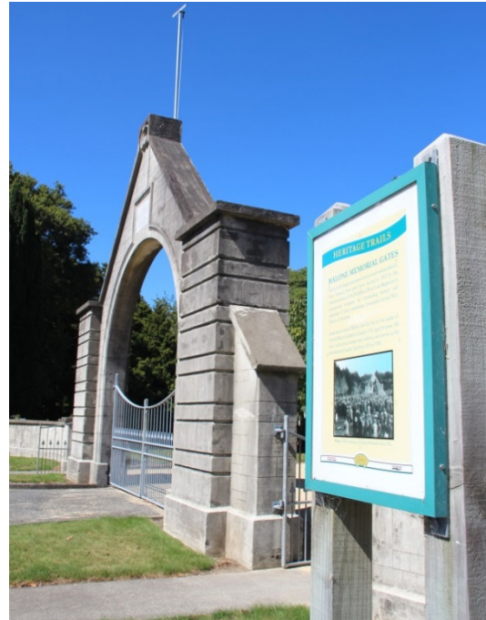
The memorial gates in the Fenton Street entrance to King Edward Park in Stratford.

Heritage New Zealand lists eight historic places in the Stratford district, including the Douglas brickworks downdraught kiln, which has a Category 1 listing. All eight are included in the district plan.