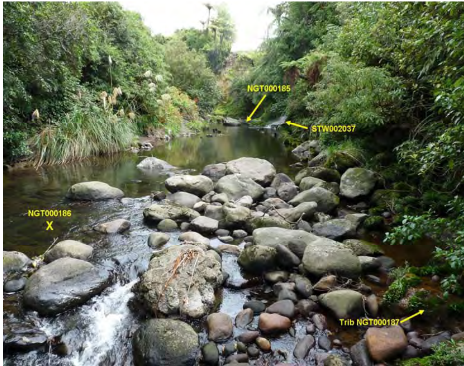
Photo 1 Sampling sites at Inglewood WTP

A routine sample of the Inglewood WTP filter backwash was collected on 7 February 2019, along with samples from upstream and downstream. The results are presented below in Table 2.