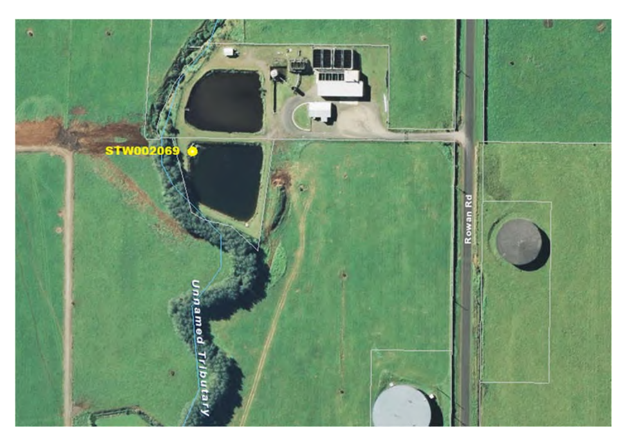
Figure 5 Aerial photo showing filter backwash sampling site STW002069 at Waimate West WTP