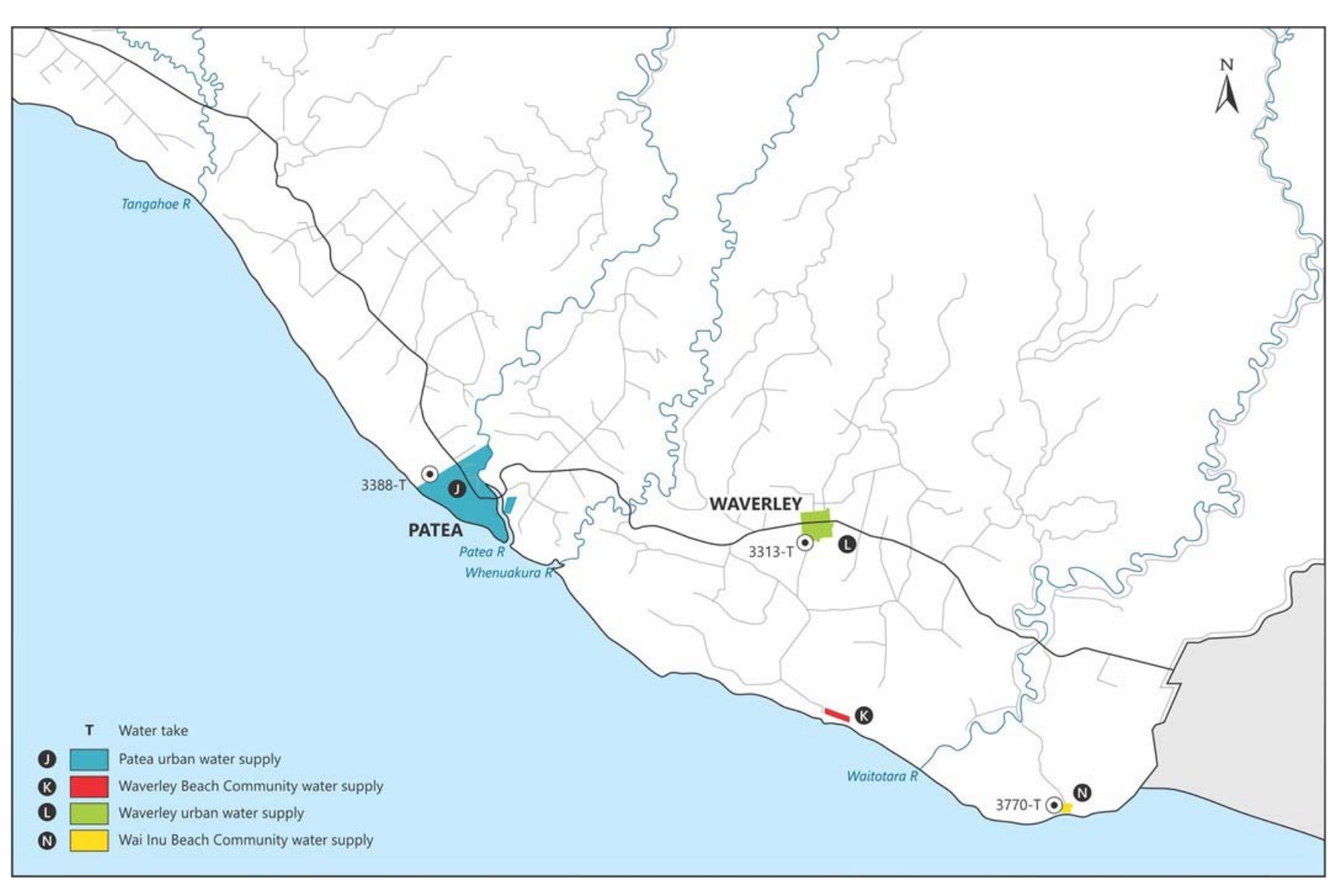
Figure 2 Location of STDC's southern consents