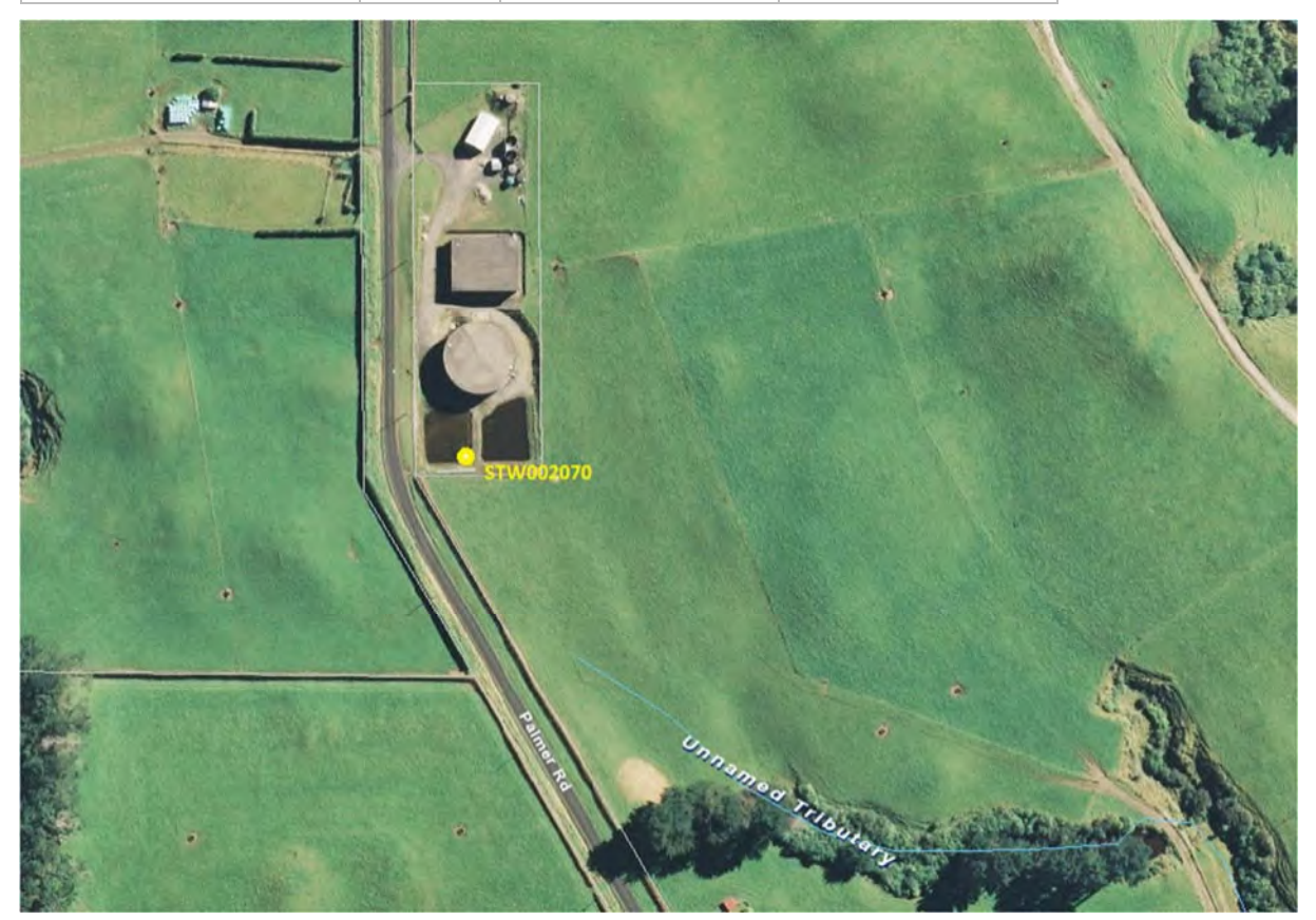
Figure 4 Aerial photo showing filter backwash sampling site STW002070 at Inaha WTP