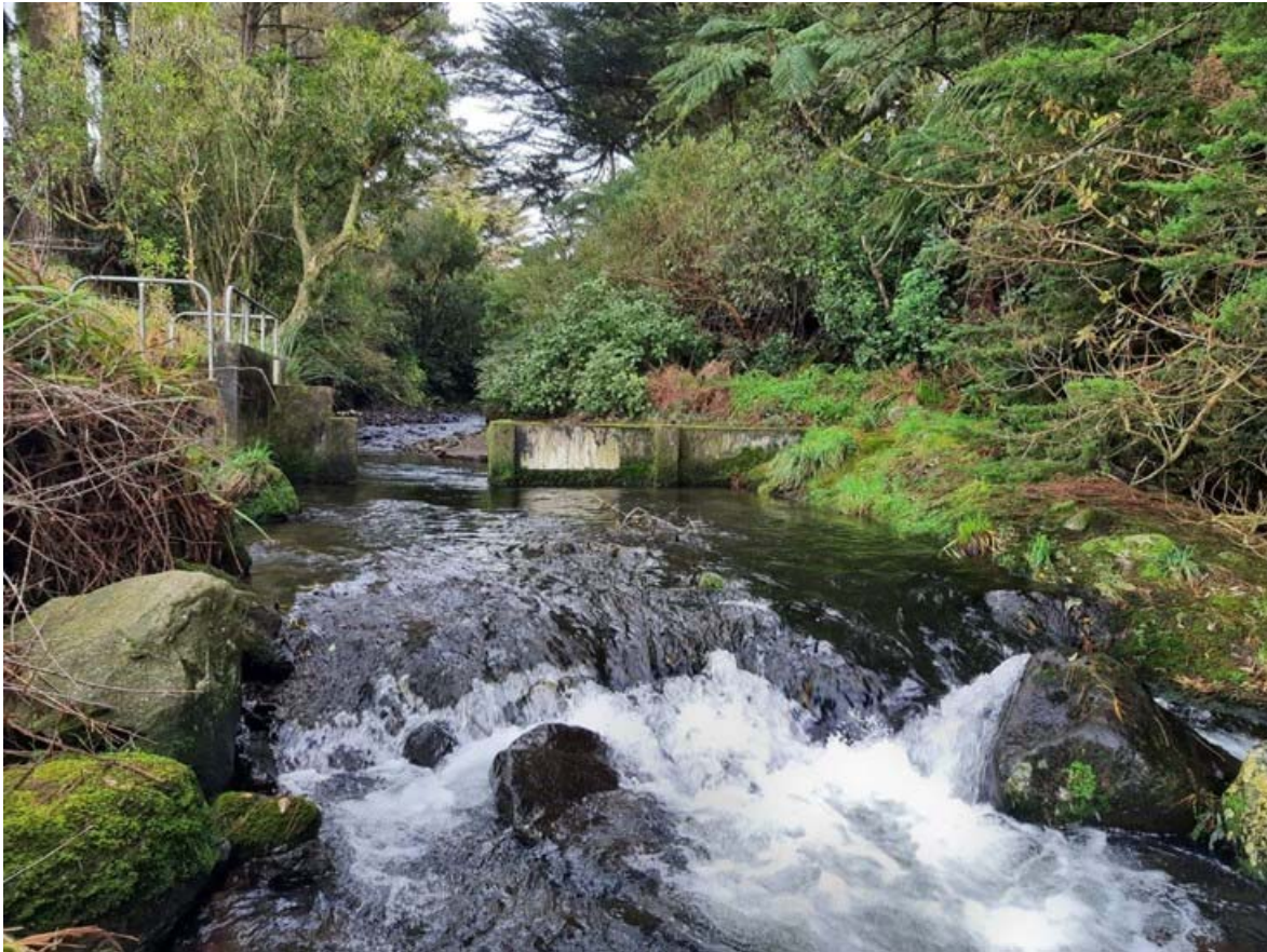
Photo 1 Konini weir with stop-boards removed (the fish pass is just out of view, on the right)