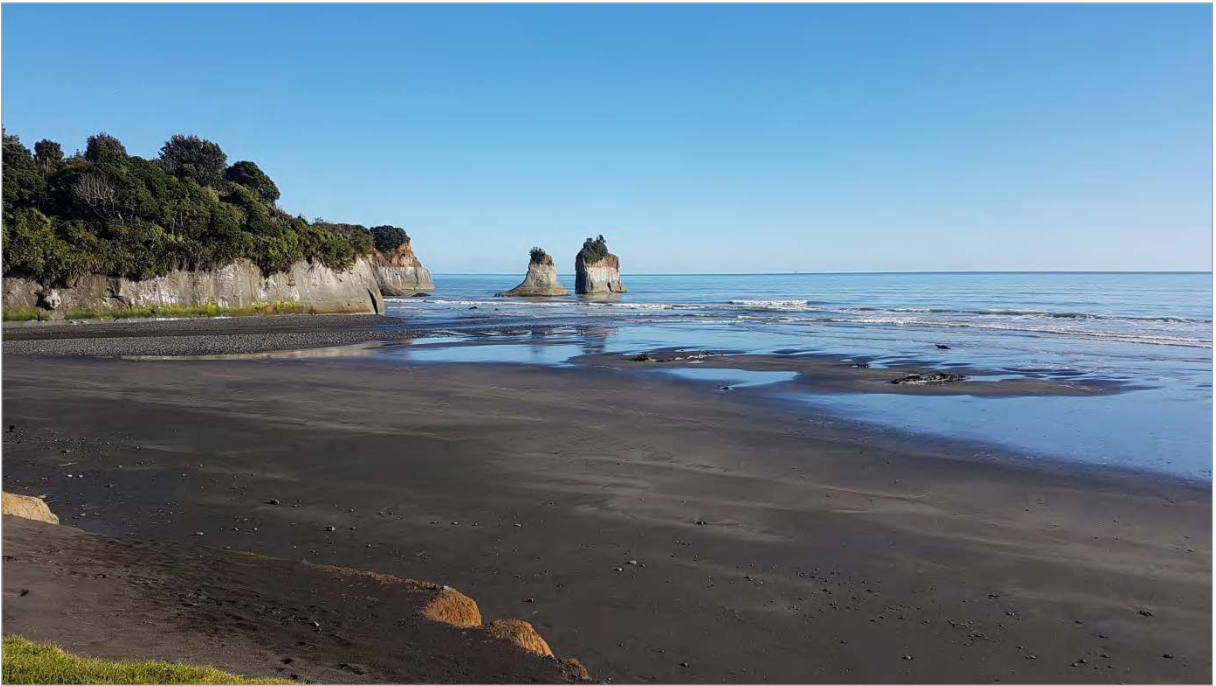
Photo 3 Onaero Beach, May 2015