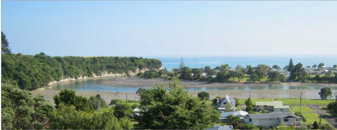
Photo 1 Urenui Estuary and Beach Camp