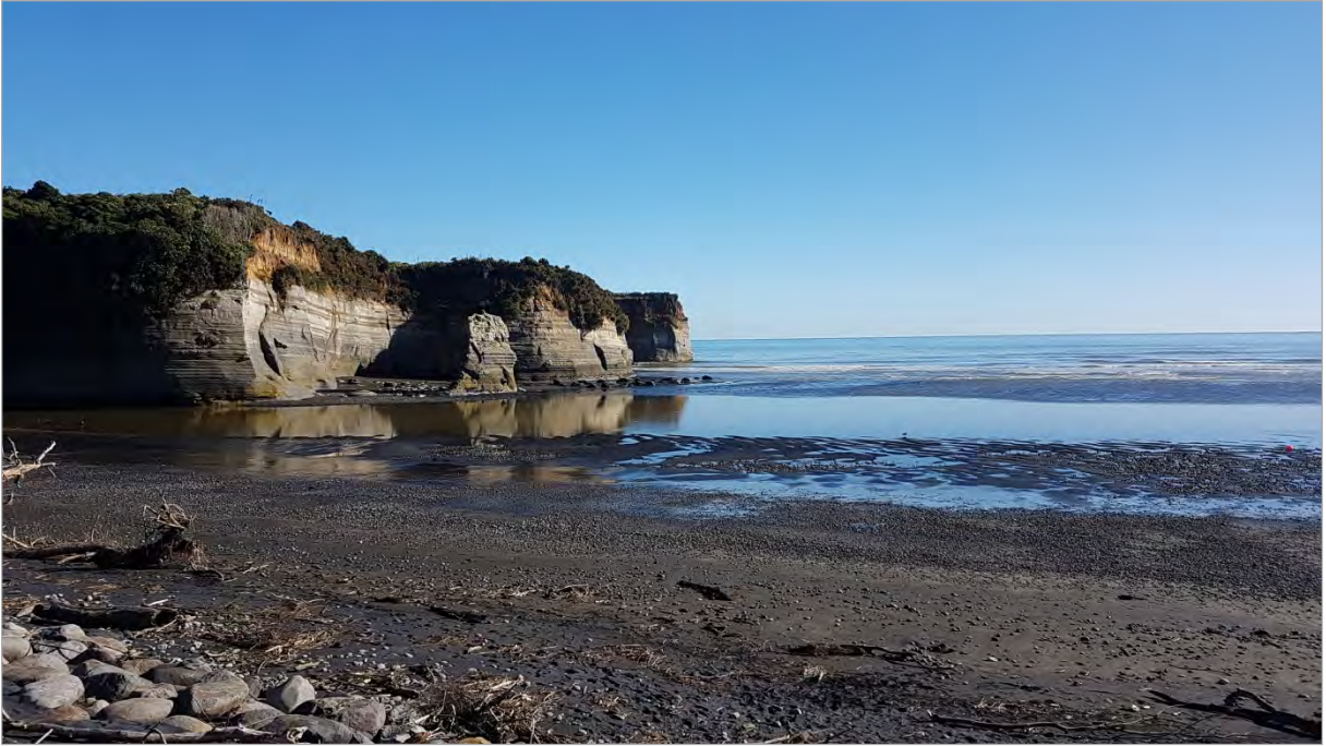
Photo 2 Urenui Beach, May 2017