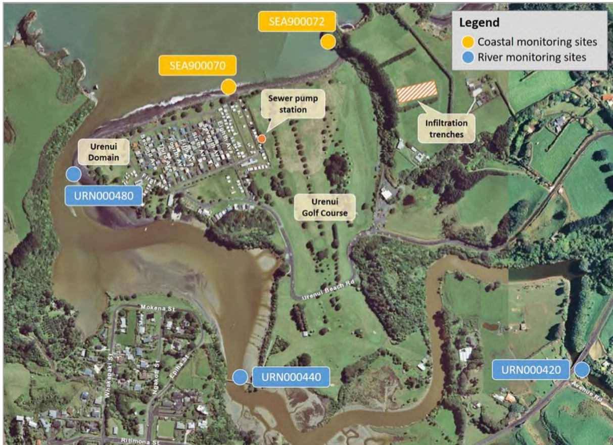
Figure 1 Map of sampling sites and other features of interest at Urenui Beach Camp

In addition to water quality monitoring during inspections, bacteriological samples were collected from Urenui Beach 200 m east of river mouth (SEA900072) and from the Urenui River at the mouth (URN000480) as part of the Council's 'Can I Swim Here' Programme over the summer bathing season (November through to March).