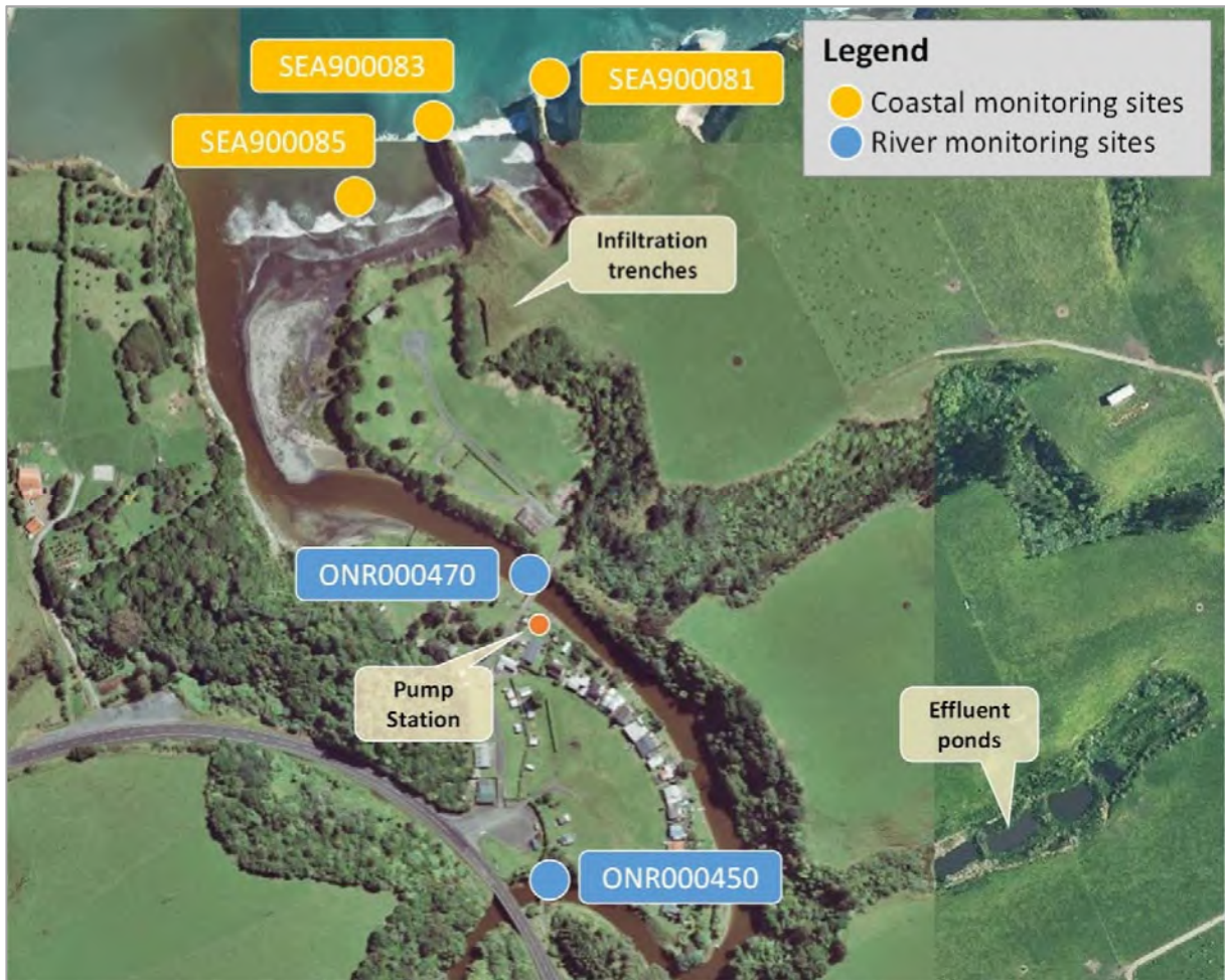
Figure 2 Map of sampling sites and other features of interest at Onaero Bay Holiday Park

In addition to water quality monitoring during inspections, bacteriological samples were collected from in front of the Onaero Surf Club (SEA900085) as part of the Council's 'Can I Swim Here' Programme over the summer bathing season (November through to March).