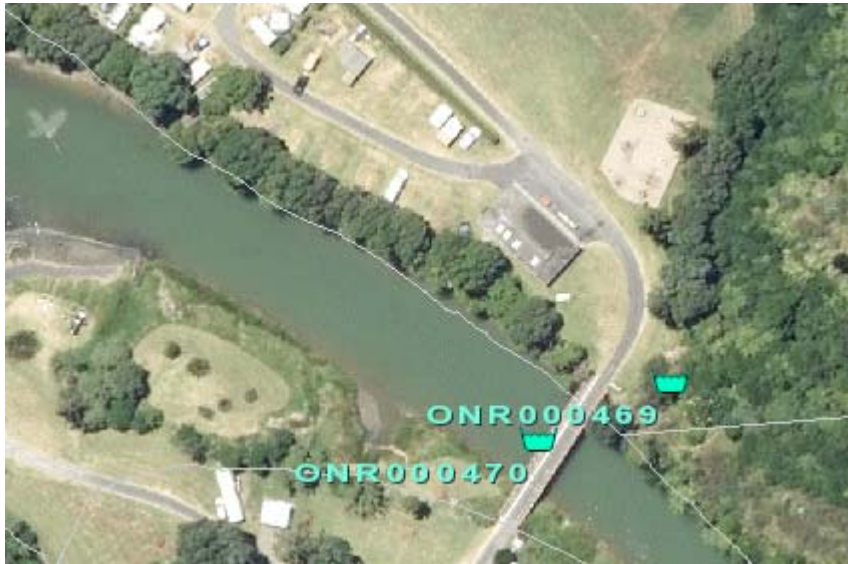
Figure 5 Location of additional sampling site Onaero trib (ONR000469), upstream of pump station bridge

During the second site inspection at Onaero Bay Holiday Park on 10 January 2022, the Council was notified that there had been some observations of a thick scum floating on the Onaero River just upstream of the pump station bridge. Additional samples were taken from a small tributary just upstream of the bridge (ONR000469, Figure 5), believed to be the source of the scum, which returned high faecal bacteria counts and triggered a series of resamples by the Council including testing for PCR markers to determine whether human, ruminant, avian or other. The results of the PCR testing determined the counts were not caused by human contamination, and were inconclusive in determining an origin of the source. The Onaero River continued to be monitored closely throughout the remainder of the summer bathing season via the Councils 'Can I Swim Here' recreational water quality monitoring programme.