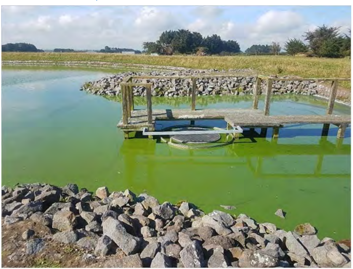
Photo 2 Algal bloom on the surface of the pond caused by high microfloral levels.

Pond microflora are very important for the stability of the symbiotic relation between aerobic bacteria in the primary pond. These phytoplankton may be used as a bio-indicator of pond conditions, for example cyanobacteria are often present in under-loaded conditions and chlorophyceae are present in overloaded conditions. To maintain facultative conditions in a pond system there must be an algal community present in the surface layer.