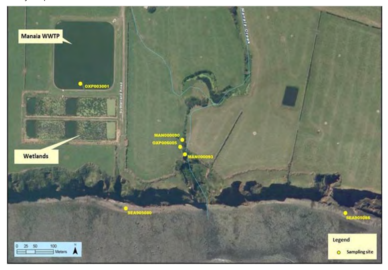
Figure 2 Aerial location map of sampling sites in relation to Manaia WWTP

The primary pond and wetland discharge were sampled for total and filtered BOD, chloride, conductivity, dissolved oxygen, E. coli bacteria, pH, suspended solids, turbidity, temperature, dissolved reactive phosphorus (DRP), and ammonia-N (NH<sub>4</sub>) on one occasion during the summer inspection. The results of this survey are presented in Table 10.