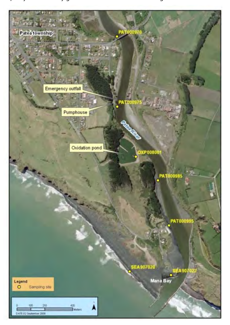
Figure 3 Map showing sampling sites in relation to Patea WWTP

The May 2020 survey was carried out around median flow (as measured at McColl's bridge). Bacterial water quality was relatively good in the river and did not change much between the sites.