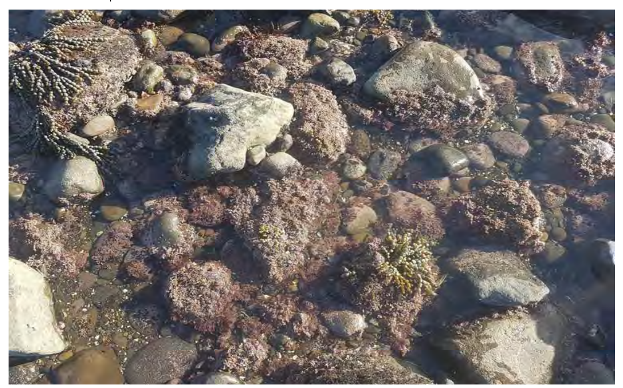
Photo 6 Low intertidal zone (approximately 50 metres west of the stream)

There was a low flow in Manaia Creek during the inspection. As it flowed onto the reef, the stream was turbid green in colour (Photo 5). This colouration was evident from the stream mouth to the low water mark, although it was less pronounced in the lower tidal zone. No foaming or surface scum was observed on the reef, and no sewage odours were detected. No discolouration, or any other visual effects or odours were noted in the tidal pools 50 metres west of the stream mouth.