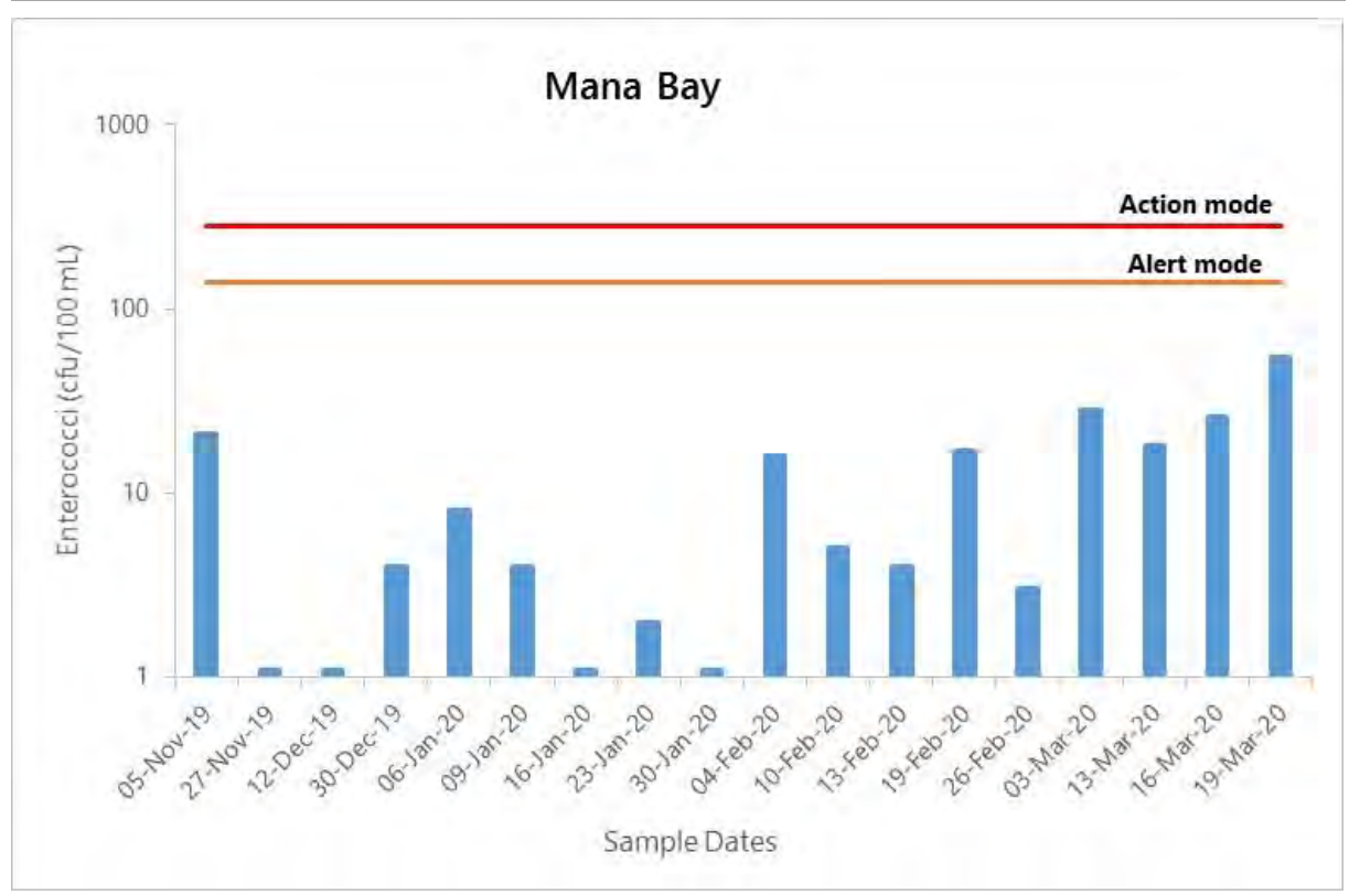
Figure 5 Enterococci numbers for Mana Bay

Water quality at Mana Bay was good throughout the season, with all samples below the 'Alert' level guideline. (Figure 5).