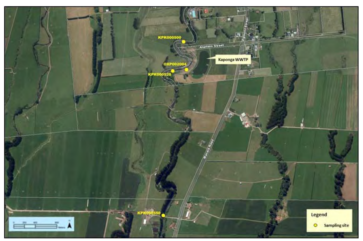
Figure 1 Aerial location map of sampling sites in relation to Kaponga WWTP

Monitoring of the impacts of the Kaponga WWTP on the receiving waters was measured using both chemical analyses of the receiving waters of the Kaupokonui River beyond the boundary of the mixing zone, and biological monitoring surveys at the same locations. Chemical sampling was carried out on three occasions during the 2019-2020 period (Section 2.1.3.1). One biomonitoring survey was conducted during summer 2020 (Section 2.1.3.2). The locations of sampling sites are listed in Table 5 and displayed in Figure 1 below.