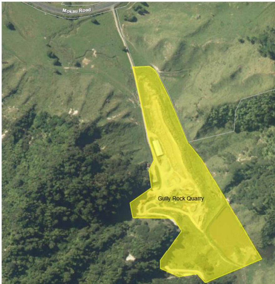
Figure 2 Gully Rock quarry, Main North Road Uruti

The Mimi River is listed in the Regional Freshwater Plan for Taranaki as having high natural, ecological and amenity values. Gully Rock Limited quarrying operation is located on the true left bank of the Mimi River along the Mokau Road, Uruti.