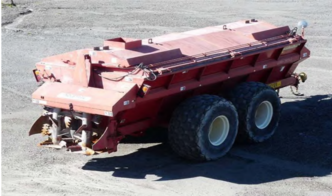
Photo 1 Spreader used for dispersing drilling waste over the landfarming area.

Stockpiled or imported top soil was spread over the disposal area and then reseeded so that it returns to pasture.