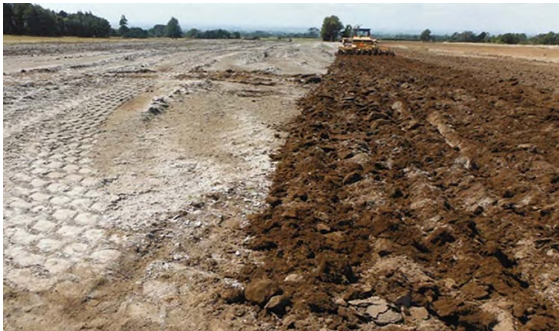
Photo 2 Drilling waste being tilled into the soil

Water treatment sludge from New Plymouth and Stratford plants was handled and discharged in a similar manner. It was received on site and either stockpiled in ponds temporarily, or spread onto paddocks to be incorporated into soil.