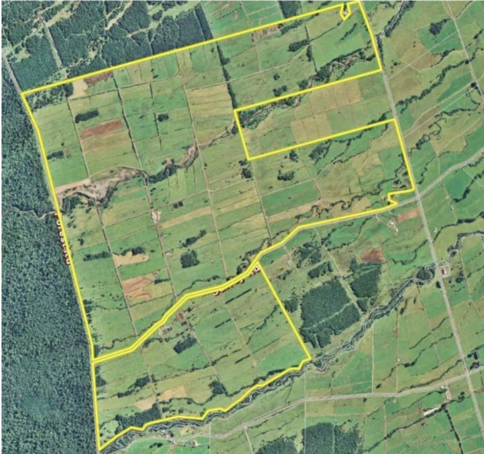
Figure 1 Location of the site and surrounding area. The property boundaries are marked in yellow

A detailed description of how drilling waste is generated in Taranaki, the contaminants associated with the waste, and the landfarming process can be found in the Review of Petroleum Waste and Land Farming (Pattle Delamore Partners, 2013) prepared for the Council. A summary can be found in section 1.1.6 below.