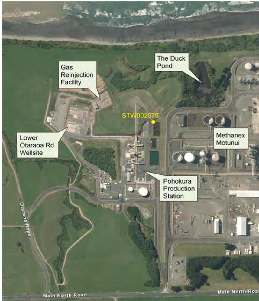
Figure 1 Pohokura onshore facilities and the combined discharge sampling site STW002075

Samples were collected of the combined discharge from the wellsite and production station at the wetland outlet (site STW002075, Figure 1) on four occasions during the monitoring year. Table 2 presents the results.