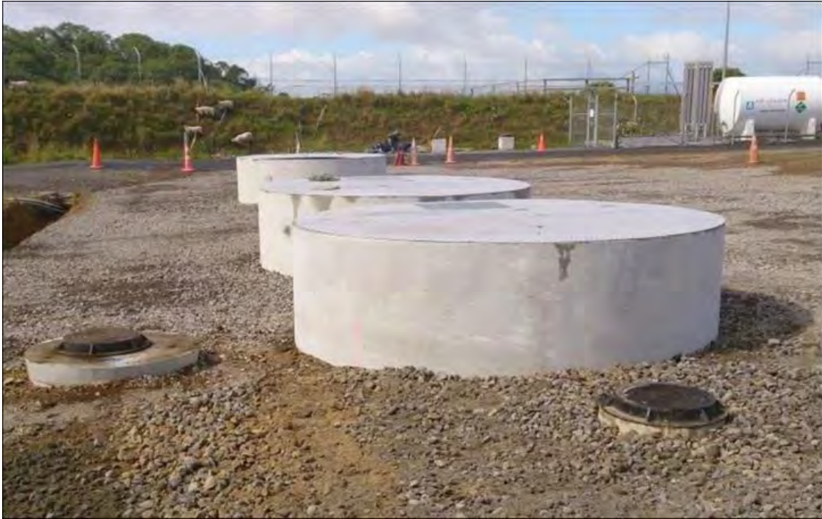
Photo 2 Upgraded stormwater system at the Lower Otaraoa Road wellsite