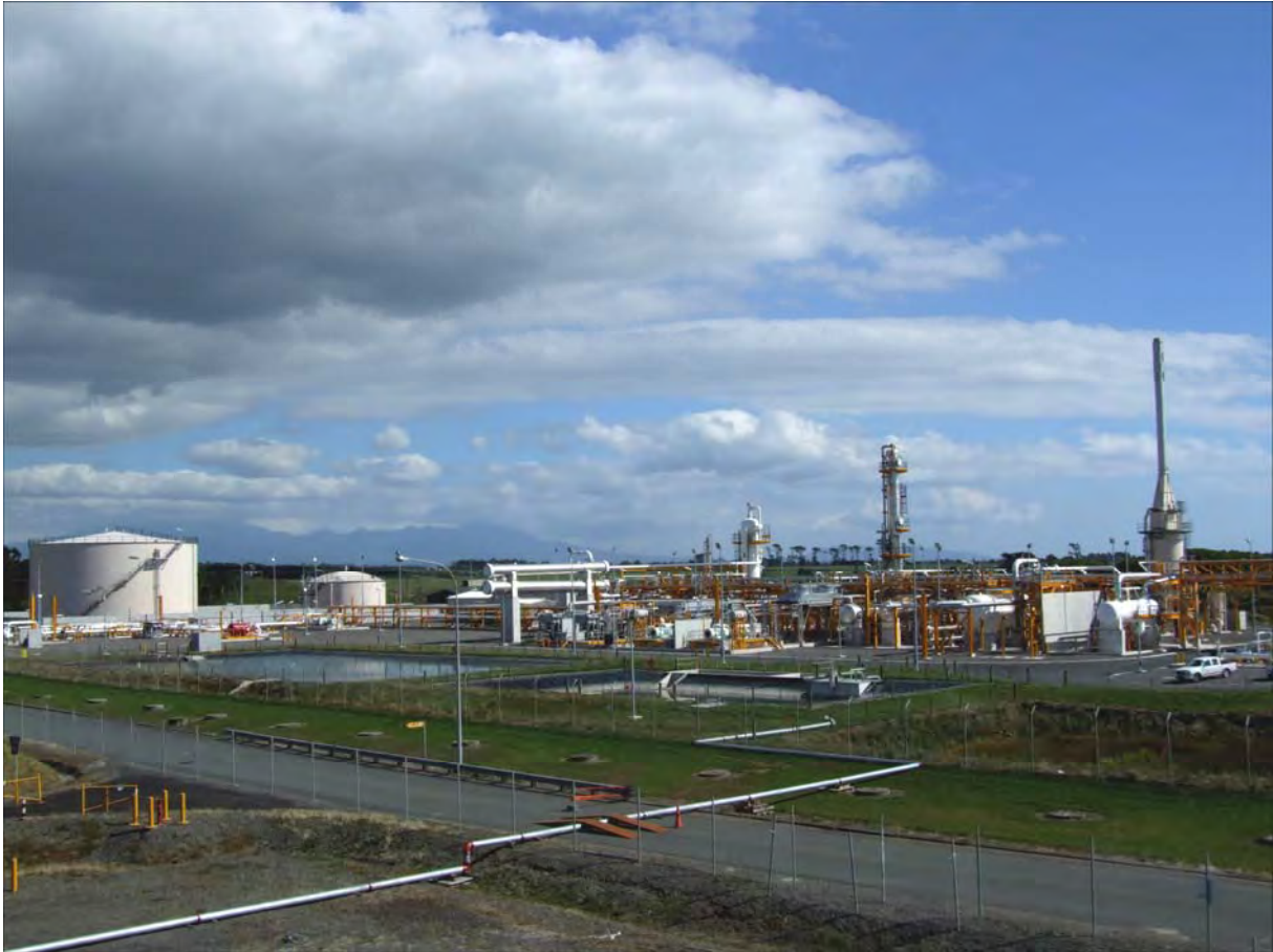
Photo 1 Pohokura Production Station

In 2002, detailed design and planning of the field, including the resource consenting process began, with construction commencing in 2005. In 2006, the major milestone of commercial gas to market was achieved from the three onshore wells.