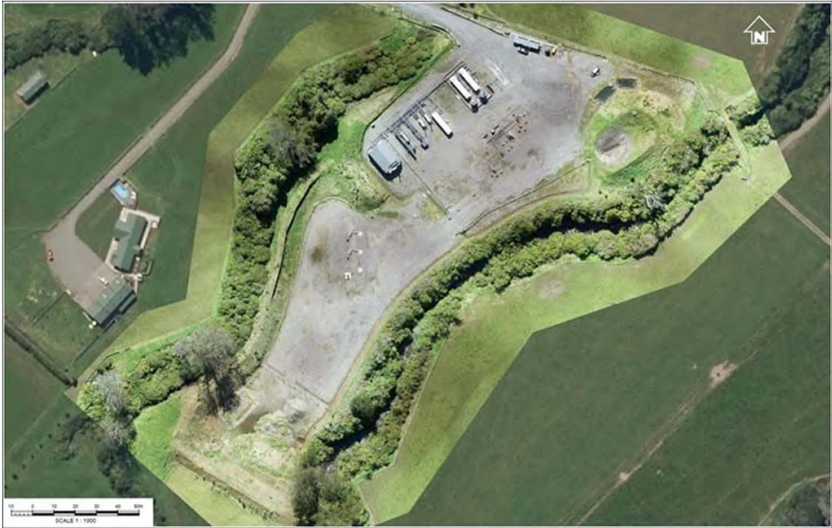
Figure 1 Sidewinder production station and wellsite (2019)