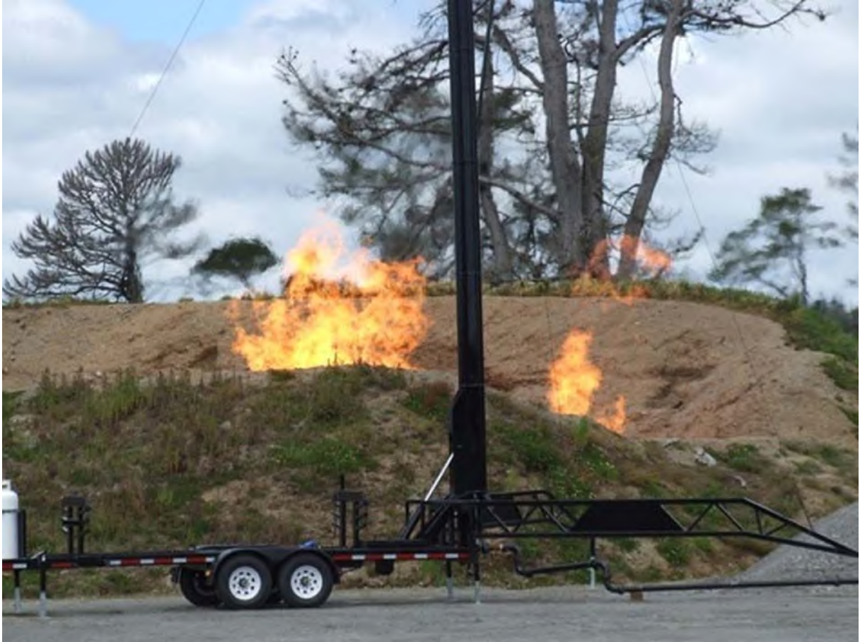
Figure 3 Clean burning flare in the flare pit at the Sidewinder Production Station