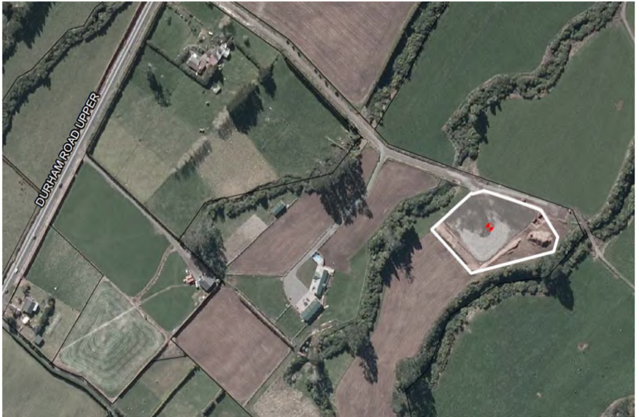
Aerial photograph showing site boundary [white line]