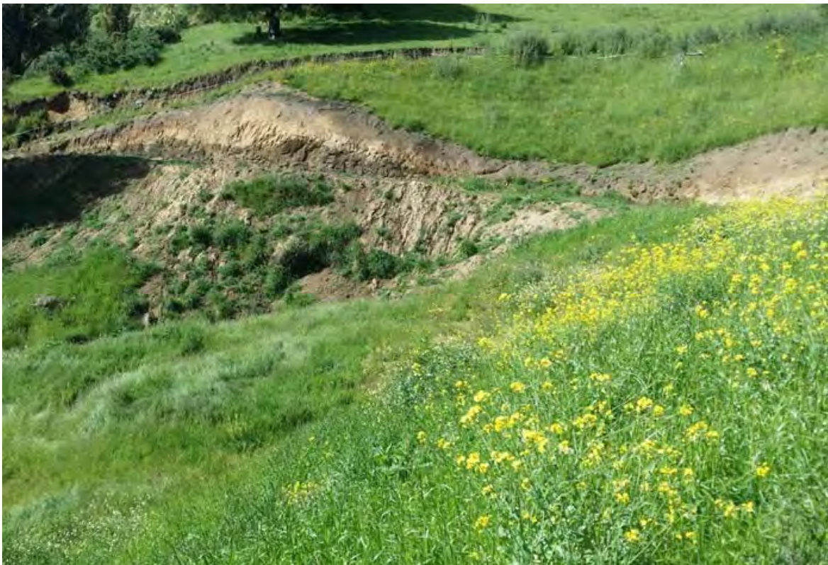
Photo 2 Photograph showing the refuse dump after capping (foreground)