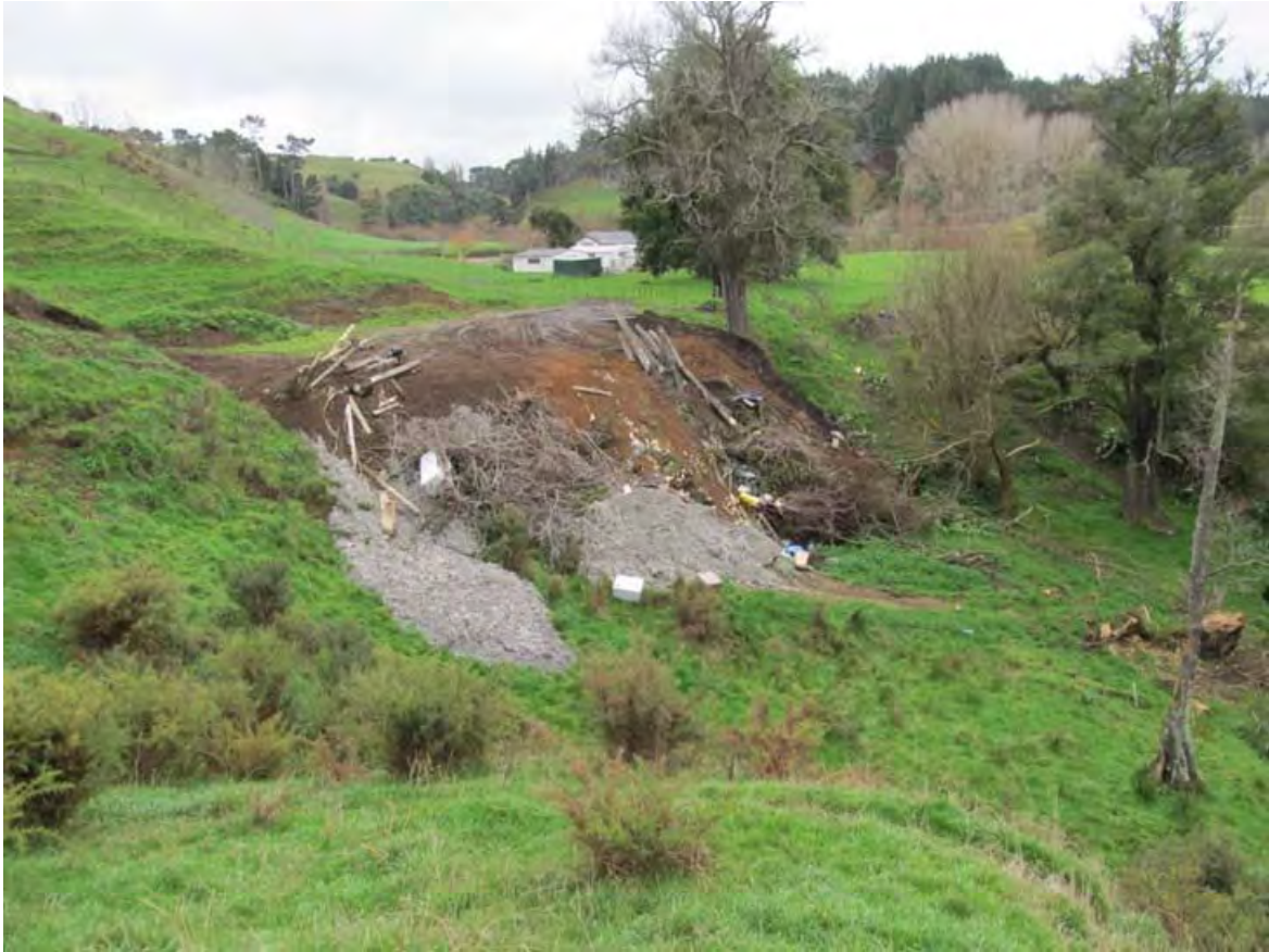
Photo 1 Photograph showing the refuse dump prior to capping