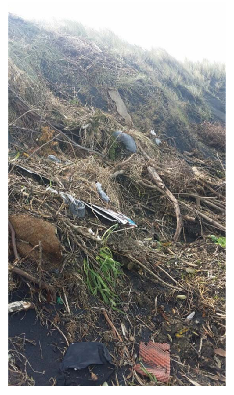
Photograph 1 Previously discharged material exposed by erosion

• Continue to remove any inorganic material at and along the coast on a regular basis.