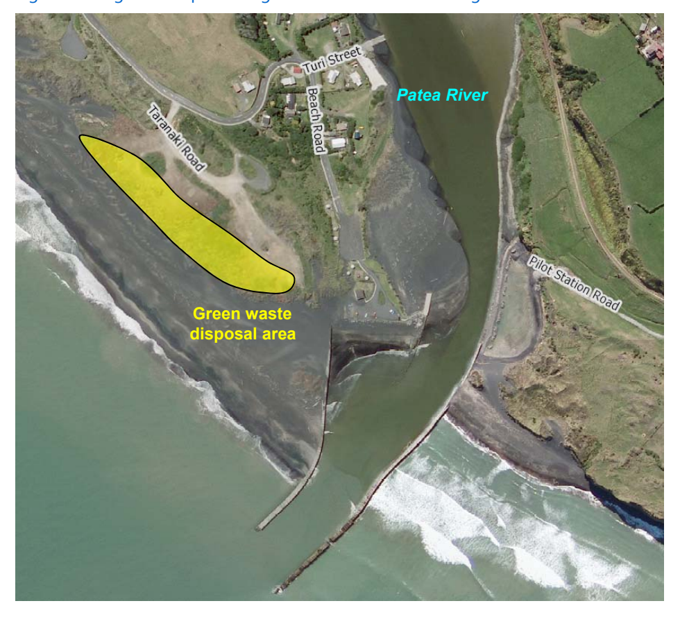
Figure 2 Aerial view of the Patea Beach green waste disposal area