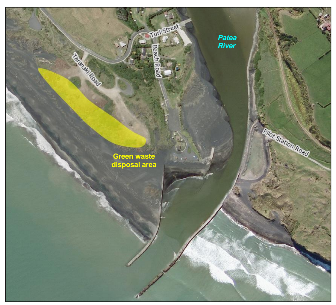
Figure 2 Aerial view of the Patea Beach green waste disposal area