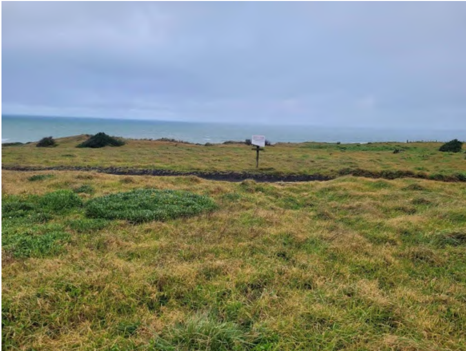
Photo 1 Patea green waste site inspection on 7 June 2023

Four routine compliance monitoring inspections were carried out during the period under review. One of the main focus' of the inspections is to check that prohibited material (as stated by STDC signage) is not being deposited at the site following the closure of the site to the public. The inspections were carried out on 1 st September 2022, 23 rd January 2023, 20 th April 2023 and 7 th June 2023, during which the site was in good condition with no signs of erosion or inorganic material. No green waste had recently been deposited to the site at the time of the inspections. The 'No Dumping Signs' and vehicle barriers along the roadway remained in place. The area continued to be well vegetated and there was no sign of any stormwater erosion at the site. Further there were no issues noted relating to odour. The site was well maintained on each inspection.