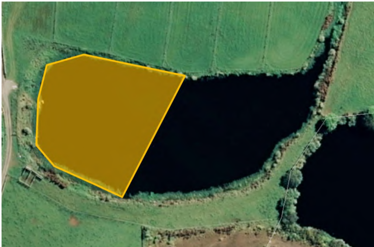
Figure 2 Extent of reclamation provided for by the Trust's consent