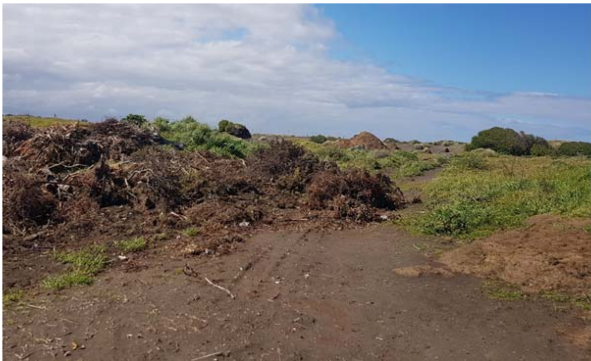
Photo 1 Malandra Downs Ltd site inspection 22/09/2021

The site was inspected during cloudy weather conditions. The delivery docket register book was sighted prior to carrying out the inspection. The docket register book appeared full and needs to be replaced. There were some stockpiles of green waste waiting to be spread, all material appeared to be compliant with consent conditions. Previous areas where the green waste had been deposited were showing signs of sand entrapment and vegetation cover. Sand erosion is still significant particularly in the south west of the designated green waste area. The Company was advised to continue to communicate with the delivery contractors what material is allowable for green waste disposal.