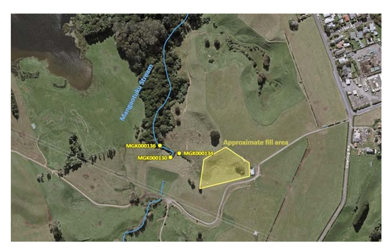
Figure 2 Location of Westown Haulage sampling sites

The results of the chemical analysis show that there was little, if any, change in water quality in the Mangaotuku Stream between the sampling sites upstream and downstream of the cleanfill.