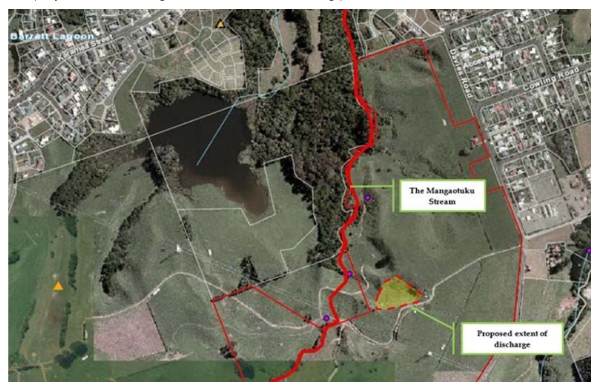
Figure 1 Location plan showing the Westown Haulage Ltd cleanfill and wood waste site on Cowling Road and the surrounding area

wood waste may be discharged at the site. From March to August the site receives very little sawdust, as the Company sells it for bedding in calf sheds and for wintering pads.