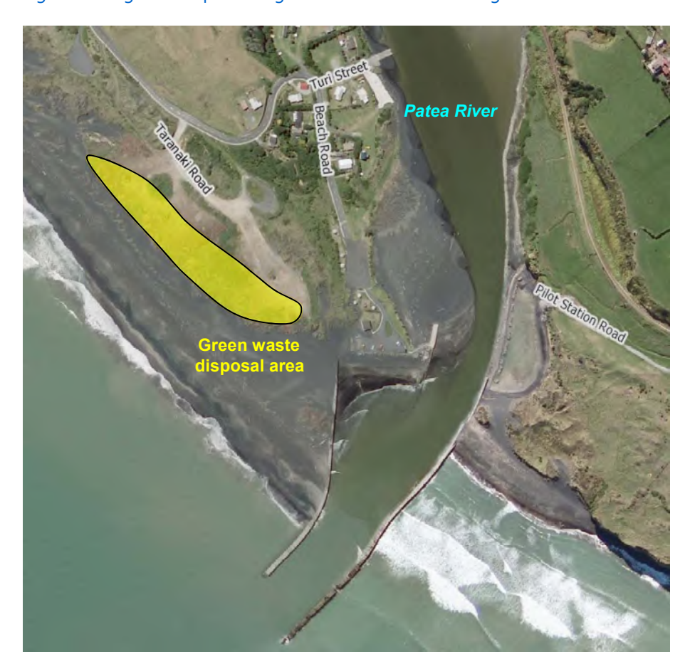
Figure 2 Aerial view of the Patea Beach green waste disposal area