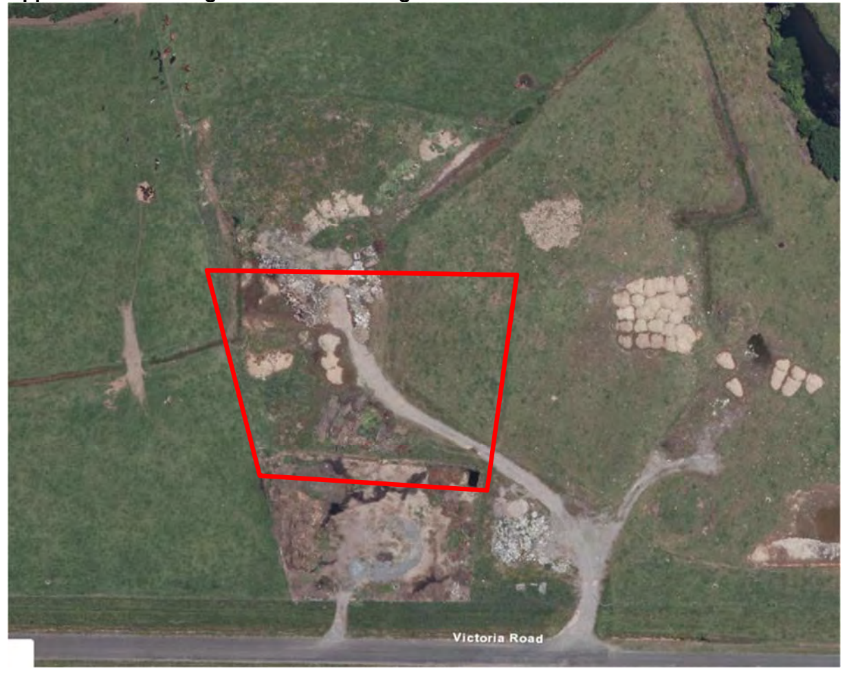
Appendix 1: Area of green waste discharge to be within the red lines