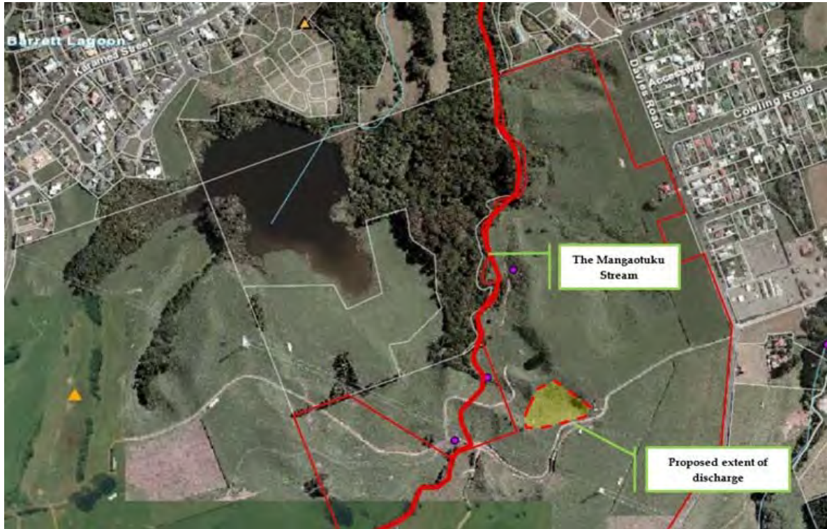
Figure 1 Location plan showing the Westtown Haulage Ltd cleanfill and wood waste site on Cowling Road and the surrounding area

wood waste may be discharged at the site. From March to August the site receives very little sawdust, as the Company sells it for bedding in calf sheds and for wintering pads.