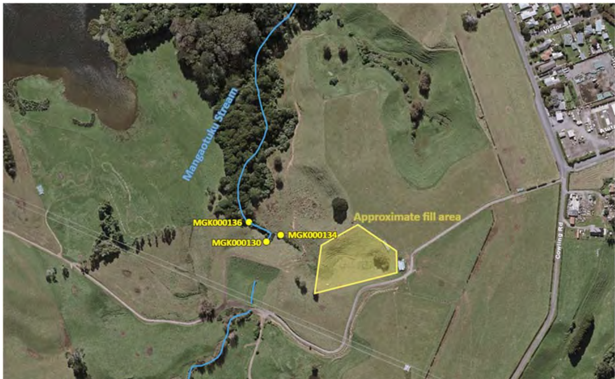
Figure 2 Location of Westown Haulage sampling sites

The results of the chemical analysis show that there was little, if any, change in water quality in the Mangaotuku Stream between the sampling sites upstream and downstream of the cleanfill.