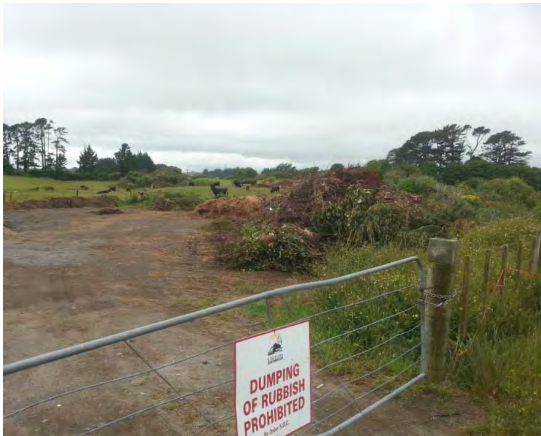
Photo 1 Central Greenwaste and Firewood's composting operation