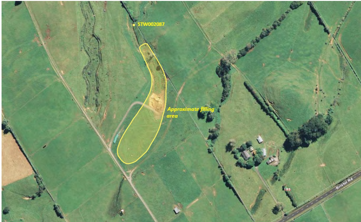
Figure 1 Aerial image of the Bristol Road site and sampling site

consist of at least 300 mm of compacted clay and 100 mm of topsoil. The capping will be done progressively as the gully is filled.