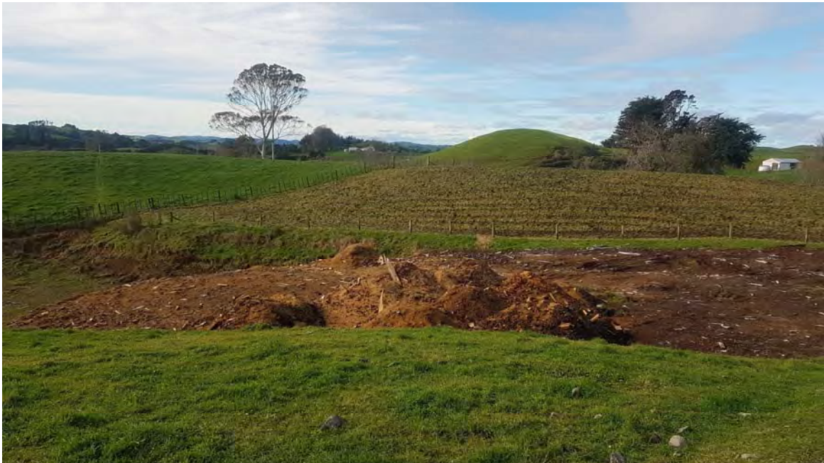
Photo 1 Value Timber Ltd wood waste cap, June 2018