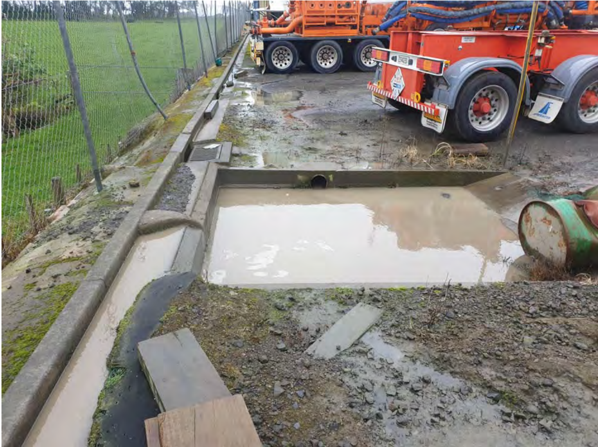
Photo 2 Sand trap, 3 July 2019