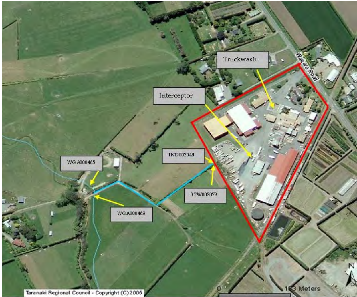
Figure 2 Location of the Hickman JD Family Trust site and associated sampling sites