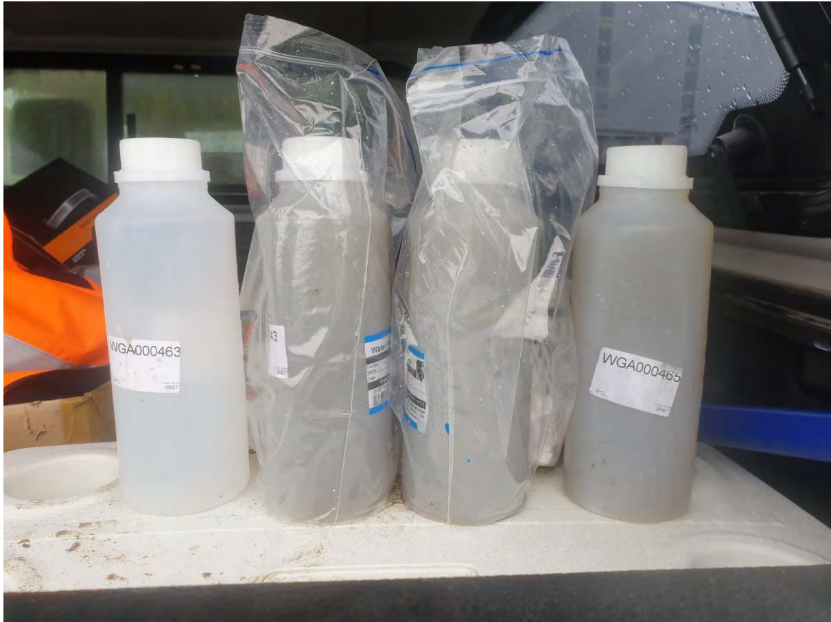
Photo 3 Water samples collected on 3 July 2019

As the samples were collected only eight minutes apart, the effect of any progression of the rainfall event on the suspended solids loading in the tributary is likely to have been minimal.