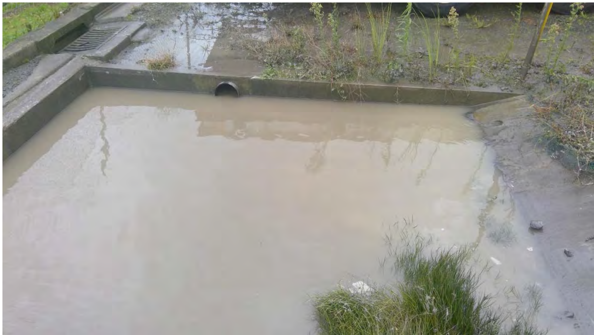
Photo 1 Sand trap, 11 April 2019

At this inspection, an on site meeting was also held with representative of the Trust. It was found that the bulk liquid bay was full of intermediate bulk containers (IBC's) and that the drain shut off valve was closed. It was noted that the parts wash interceptor was due to be emptied shortly, however this was visually compliant at the time of inspection. It was observed that the sand trap upstream of the stormwater discharge point contained sediment, although there was no visible hydrocarbon sheen (Photo 1). The Trust was advised by the inspecting officer that the sand trap be fully cleaned out soon. No objectionable and or offensive dust or odour was detected off site at the time of inspection.