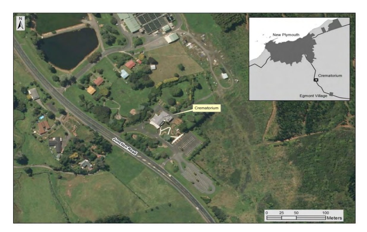
Figure 1 Location of New Plymouth crematorium

As shown on the graph in Figure 2, the establishment of the crematorium of W Abraham Ltd crematorium resulted in a substantial reduction in the number of cremations in 2009-2010 at the NPDC crematorium, and numbers remained similar at just over 320 cremations during the years following with 375 cremations carried out in the 2017-2018 period. 205 cremations were via the Newton cremator and 170 cremations via the Elecfurn cremator.