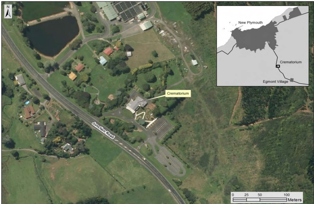
Figure 1 Location of New Plymouth crematorium

The New Plymouth crematorium has been operating at its site on Junction Road (Figure 1), 5 km south of the city, since 1961. It was the only crematorium in the Taranaki region until March 2009, when of W Abraham Ltd crematorium commenced operation at Bell Block. Approximately 320 cremations are undertaken annually.