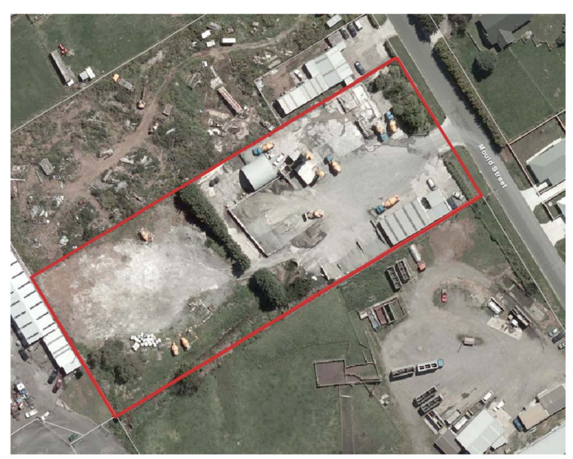
Figure 1 Location of Allied Concrete site, Mould Street, Waitara

Sludge from the settling ponds is removed periodically and stored on site to dry. Excess concrete from the returning trucks is also off loaded at the site, where it is then made into large blocks that are sold to farmers and local contractors.