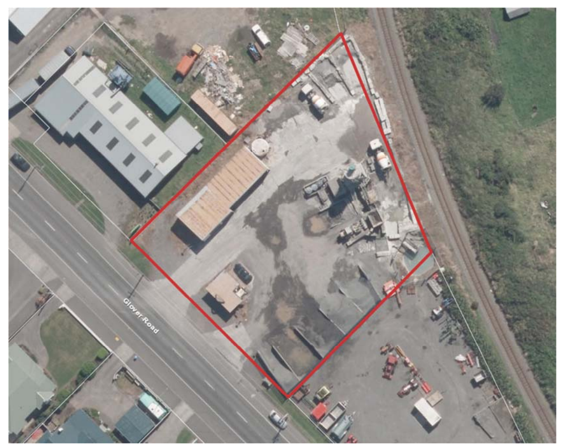
Figure 2 Location of Firth Industries site, Glover Road, Hawera

Sludge from the settling ponds is removed periodically and stored on site to dry. Excess concrete from the returning trucks is also off loaded at the site, and is then made into large blocks that are sold to farmers and local contractors.