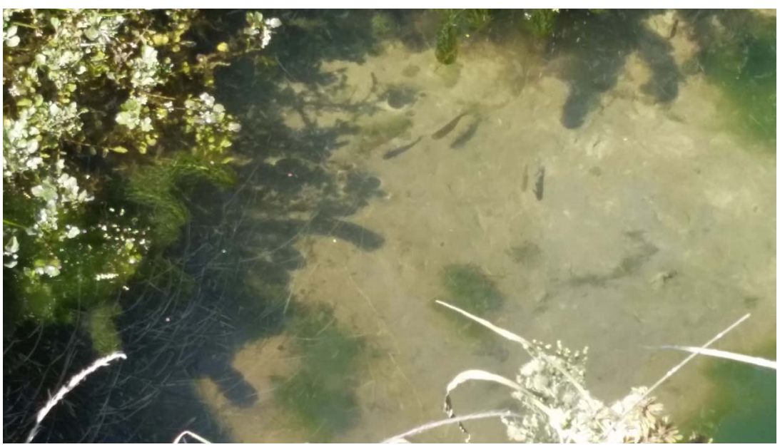
Photo 1 Unidentified Galaxiids found in the tributary at the culvert inlet on the Allied Concrete Waitara site