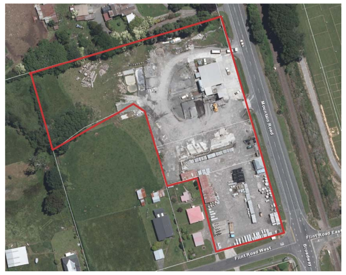
Figure 3 Fletcher Concrete site (Firth Industries and Humes Pipeline Systems), Stratford

Two new sludge drying bins and a concrete mould area. These are to be fully contained, with wastewater being directed to the truck wash out wastewater settling area.