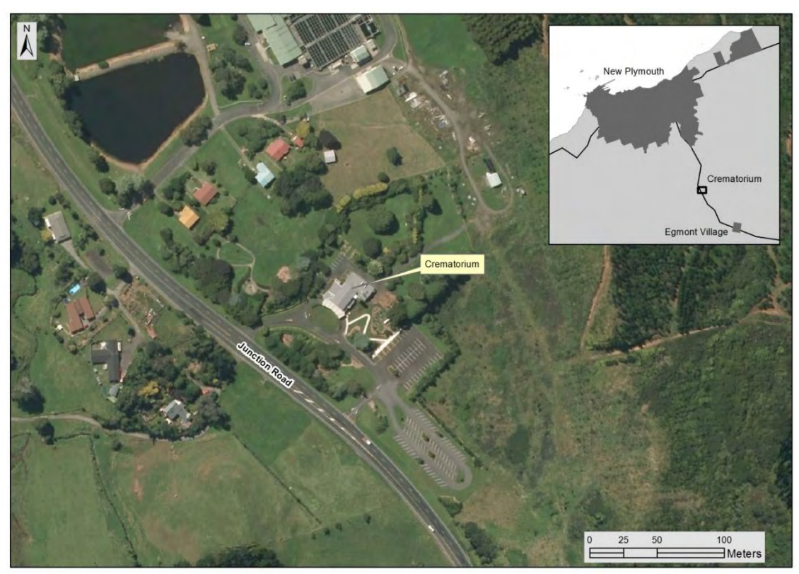
Figure 1 Location of New Plymouth crematorium

The New Plymouth crematorium has been operating at its site on Junction Road (Figure 1), 5 km south of the city, since 1961. It was the only crematorium in the Taranaki region until March 2009, when the crematorium of W Abraham Limited commenced operation at Bell Block. Approximately 300 cremations are undertaken annually.