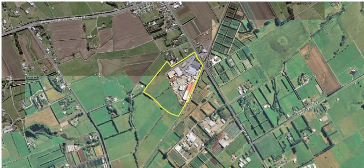
Figure 1 Aerial location map of Hickman JD 1997 Family Trust

This site was originally the Brixton Dairy Factory until it shut down and the discharge resource consent was transferred into Hickman JD 1997 Family Trust.