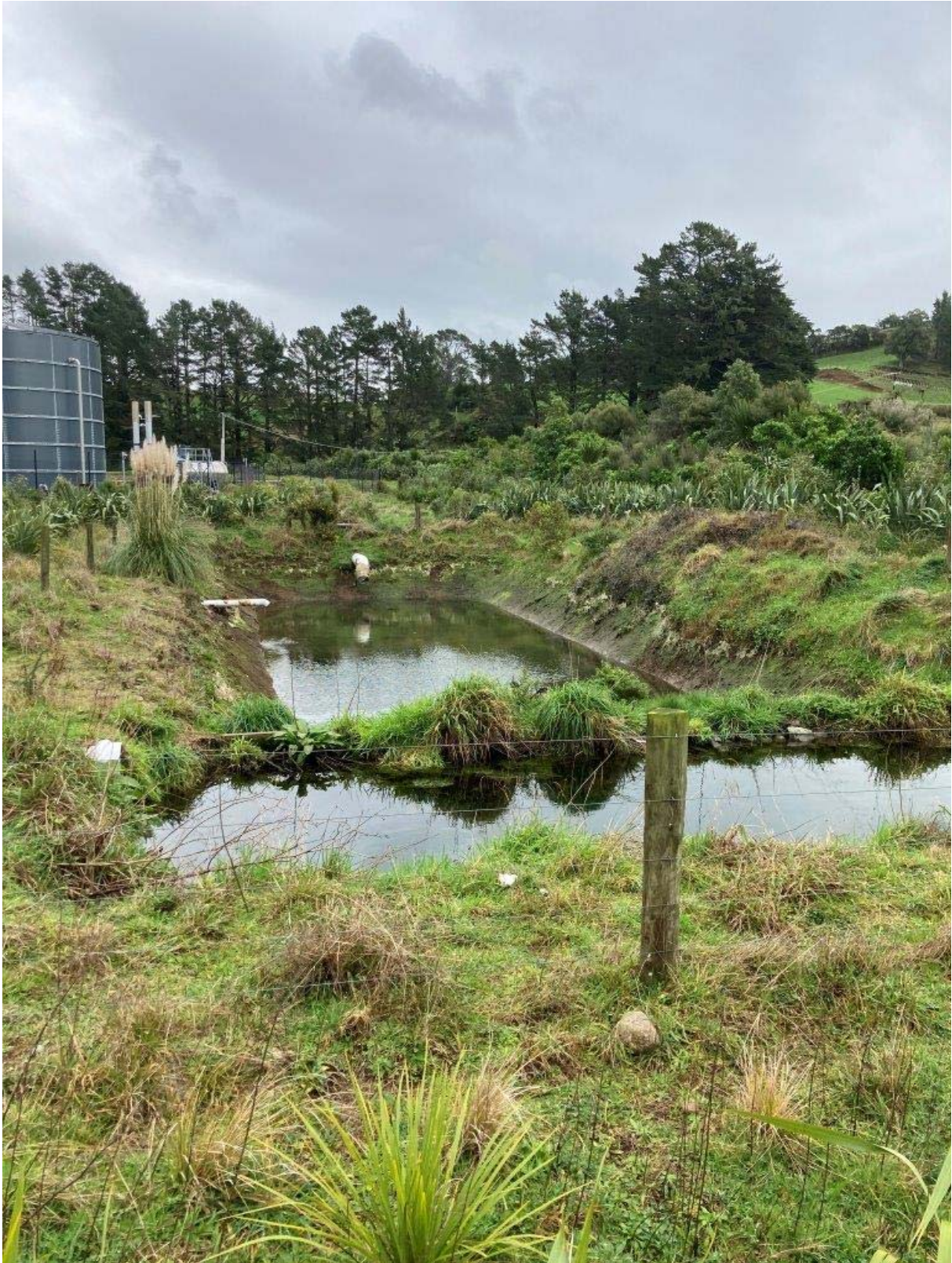
Photo 1 Stormwater sediment/retention ponds system