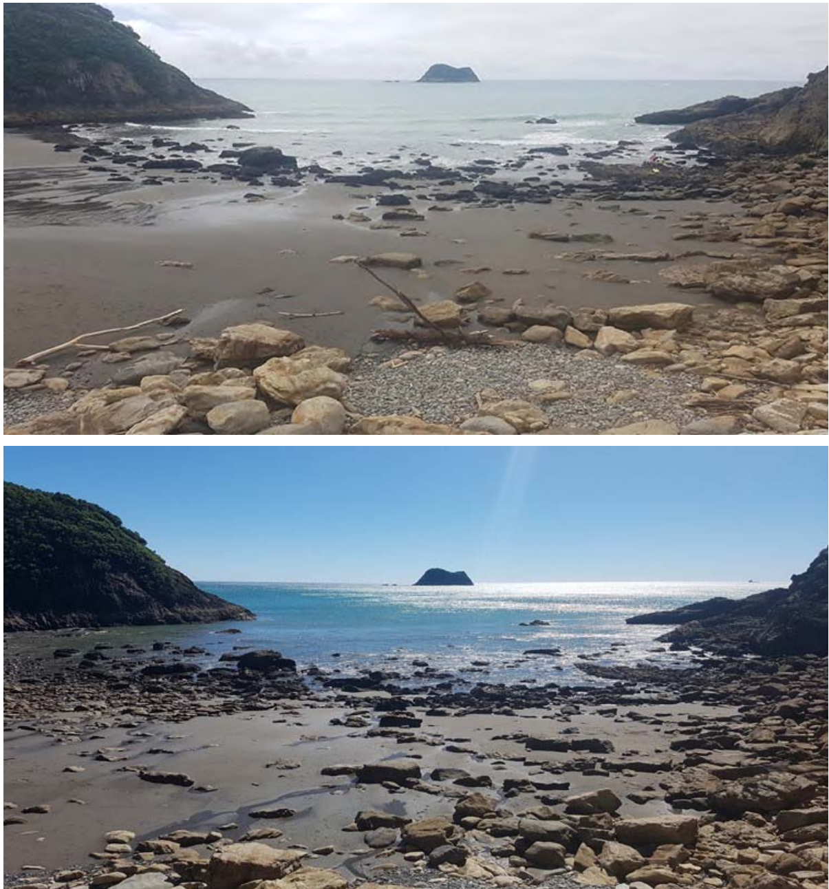
Photo 1 Rocky intertidal reef at the northern end of Back Beach (top; Jan 2021, bottom; March 2022)

The second survey area was in the low intertidal zone, where the groundwater seep mixed with the sea. The level of sand at this site was relatively high, limiting the amount of available rocky habitat. Still, biomass and diversity was much higher here compared to the high shore site (typical for this tidal height). Six algal species were identified, with Scytothamnus australis having highest coverage. Barnacles were present, but less abundant than at the high shore site. Instead, coverage of the little black mussel Xenostrobus pulex increased significantly. Four species of grazing molluscs (a limpet, chiton and top shells) and three species of predatory whelks were present. Amphipods were also found at this site.