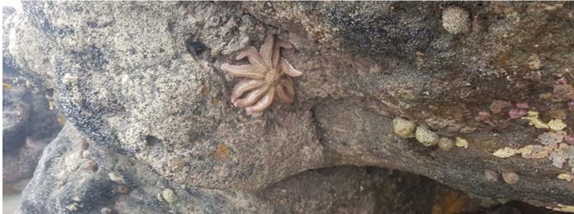
Photo 2 Reef star ( S. australis ), whelks and their eggs ( D. orbita ) on a large boulder in the low intertidal zone

Overall, based on observations made during this inspection, the groundwater seep did not appear to be adversely affecting the local reef biota. Instead, the fluctuating sand coverage at this site (and resultant changes in habitat availability), appears to be a significant driver in rocky reef community structure. The diversity of reef biota immediately west of Paritutu Rock is typical of that seen at other intertidal reefs in the Taranaki region.