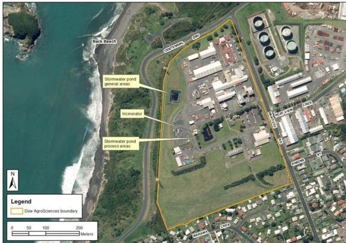
Figure 1 Aerial photograph of the Corteva Paritutu Road site