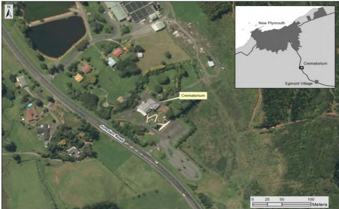
Figure 1 Location of New Plymouth crematorium

As shown on the graph in Figure 2, the establishment of the crematorium of W Abraham Ltd crematorium resulted in a substantial reduction in the number of cremations in 2009-2010 at the NPDC crematorium, and numbers have steadily increased to around 400 cremations during the years following with 395 cremations carried out in the 2020-2021 period. 295 cremations were via the Newton cremator and 100 cremations via the Elecfern cremator.