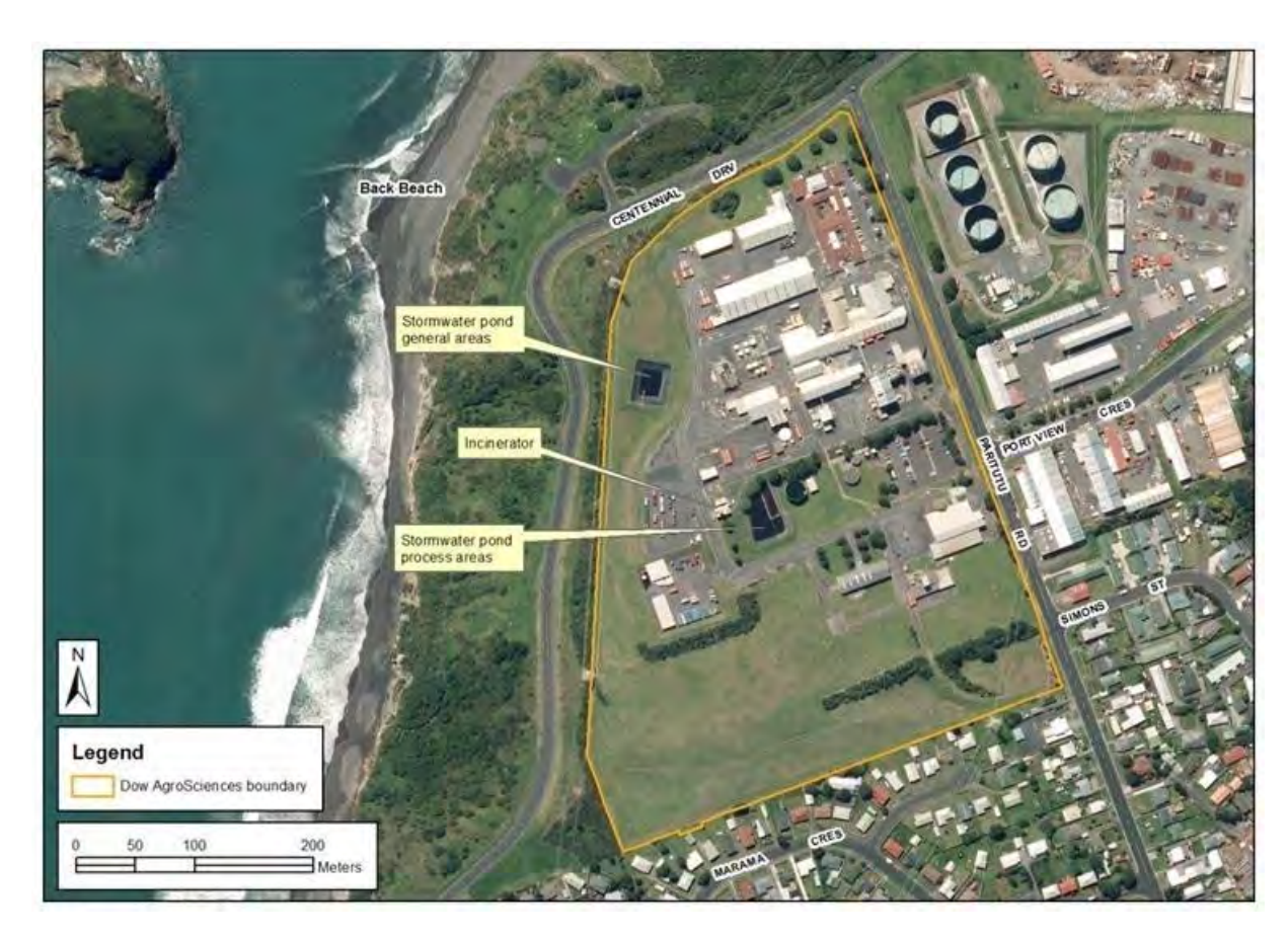
Figure 1 Aerial photograph of the DAS Paritutu Road site