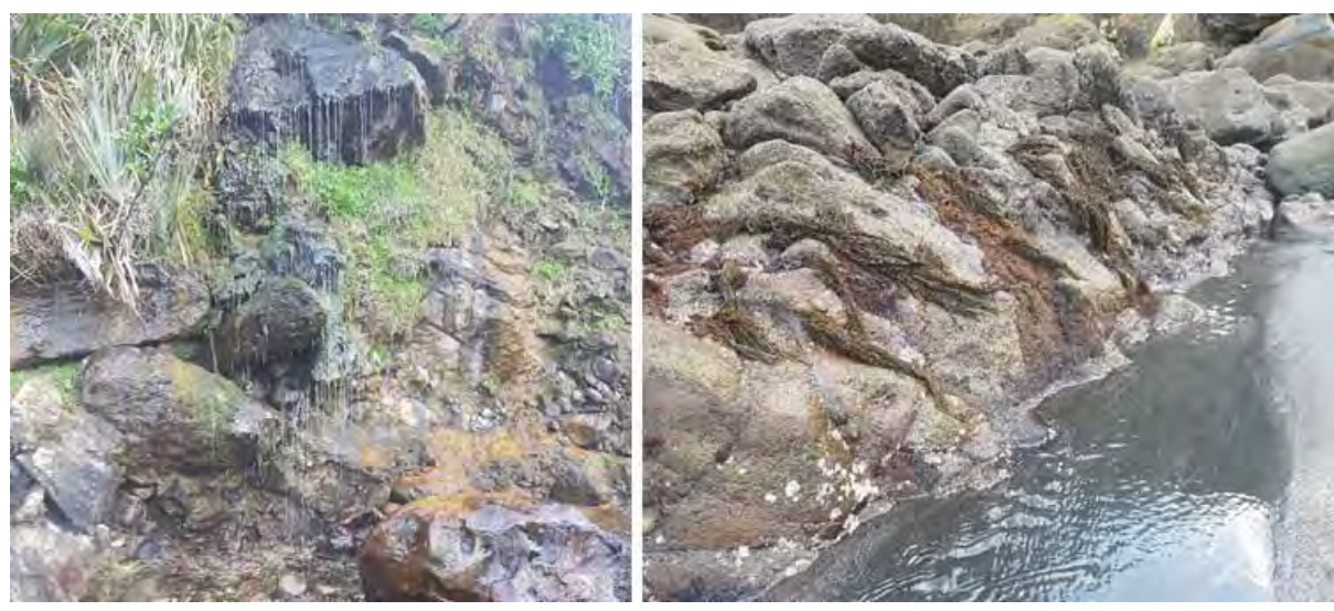
Photo 2 Groundwater seep at the base of Paritutu Rock (left), groundwater flowing past the low shore rocky reef (right)

The third survey area was in the low intertidal zone, 50 metres west of where the groundwater seep mixed with the sea. Biomass and diversity was not as high as the previous site, and this was likely due to greater wave exposure and less available habitat. Eight algal species were present, although with much lower coverage than at the previous site. The coverage of little black mussels at this site was significant, as was the abundance of the predatory whelk, Dicaithis orbita . Anemones and grazing molluscs were also present.