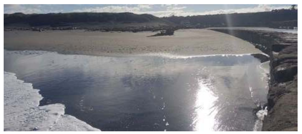
Photo 14 Sand build up outside the western mole at the Patea River mouth, 22 May 2018

The half tide training wall, wave guide wall and Mana Bay seawall all appeared to be in good condition, having no notable adverse effects. The Carlyle Beach rock protections were not immediately obvious during the inspection and it is suspected that they have been buried by the large volume of sand that has built up inside the river mouth.