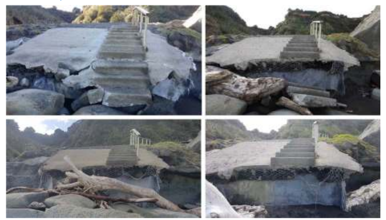
Photo 13 Waihi Beach access (clockwise from top left: May 2015, May 2016, April 2017 and May 2018)

The Waihi Beach access ramp was inspected on 22 May 2018. The structure and adjacent land has continued to erode since the last inspection, though the rate of erosion appears to have slowed (Photo 13).