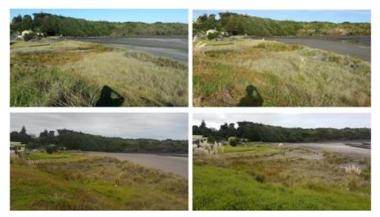
Photo 12 Dune planting at Opunake Beach (clockwise from top left: May 2015, May 2016, April 2017, May 2018)