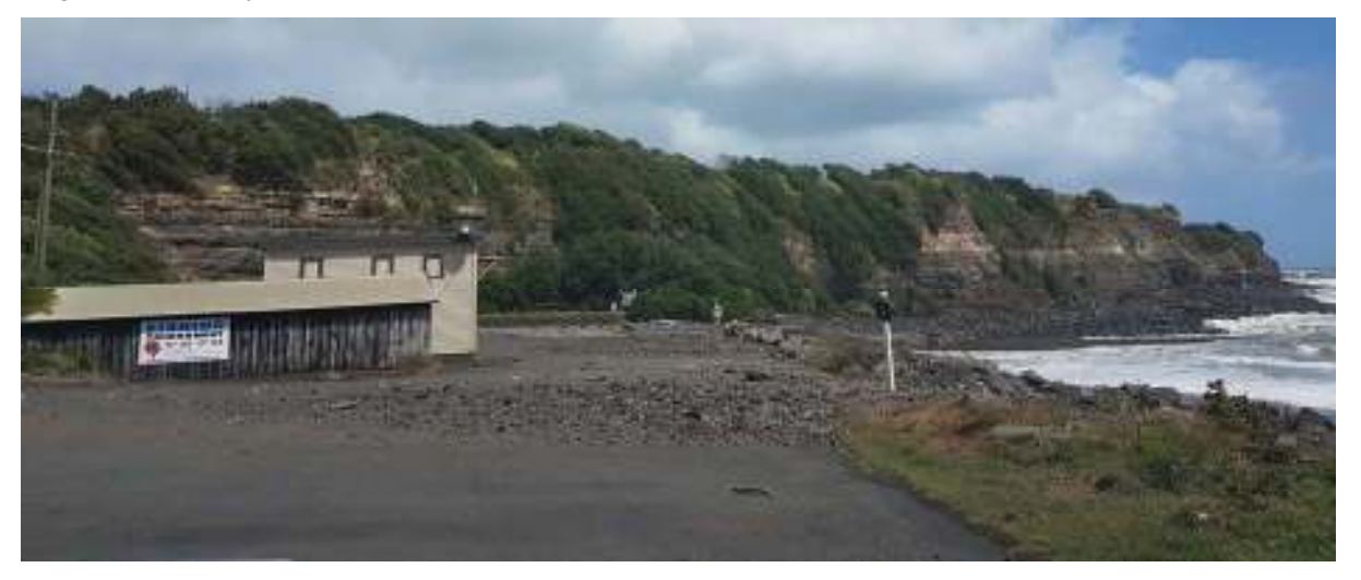
Photo 17 Rocks and gravel washed onto Middleton Bay car park by Ex-Cyclone Fehi.

As is often the case, Taranaki's coastal environment received intermittent bouts of high energy, stormy conditions in the monitoring period under review. However, the beginning of February was marked by an extraordinary meteorological event. Coinciding with a king tide, Ex-Cyclone Fehi brought winds and storm surges that battered the Taranaki coastline beyond its typical threshold. In North Taranaki, a large amount of work was required to repair a number of hard protection structures and dunes systems which were damaged as a result of this event. South Taranaki was also impacted by this event, and subsequent storm surges later in the year (Photo 17).