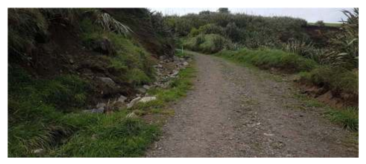
Photo 4 Beach track at the end of Denby Road leading to the gabion mattress consented under 6736 (April 2017)

STDC installed a gabion mattress at the bottom of the access track with the intention of improving access to the beach and helping control the erosion problems. The mattress measured 6 m x 2 m x 0.23 m in size and was placed on existing rocks. Surrounding the rocks a geo textile fabric was used to prevent the scouring of sand and to increase the longevity of the structure. Once completed, the structure was covered in concrete to further aid pedestrian access. The structure is authorised by coastal permit 6736 .