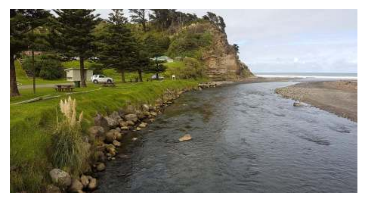
Photo 3 Looking downstream along rock protection works in the Kaupokonui Stream (April 2017)