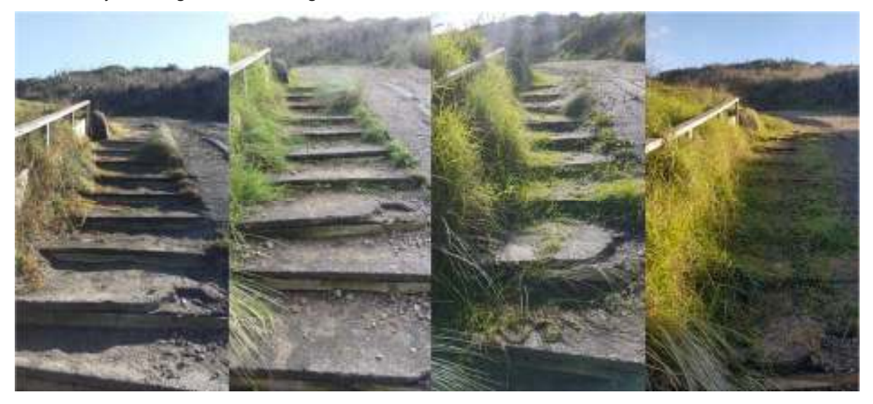
Photo 16 Deterioration of the Caves Beach access ramp (from left to right: May 2015, May 2016, April 2017 and May 2018)

Caves Beach was visited on 22 May 2018. The condition of the steps had continued to deteriorate and were now covered with grass and sand (Photo 16). The bank at the base of the structure showed signs of scouring; a process that is potentially aggravated by the stream that runs across the beach at the base of the ramp. Overall, the access ramp down to Caves Beach still provided beach access and did not appear to be adversely affecting the surrounding environment.