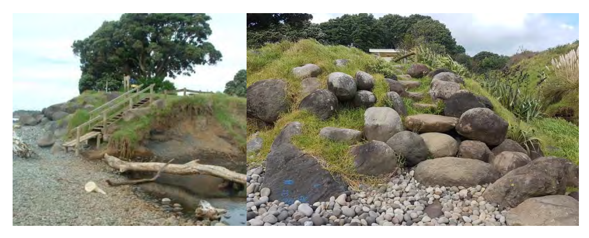
Photo 9 Step access to Bell Block Beach (previous wooden steps July 2005 and current rock steps May 2017)