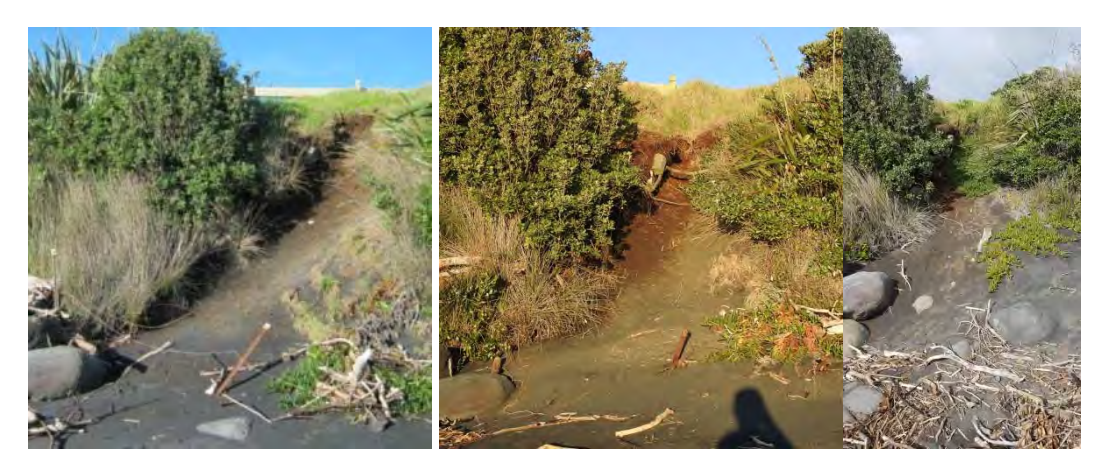
Photo 35 Close up of erosion present in front of Board Riders club caused by human foot traffic (June 2013, June 2016 and May 2017)

The plantings in front of the New Plymouth Surf Riders Club have made major improvements in preventing erosion of the bank (Photo 36). The area is also well fenced.