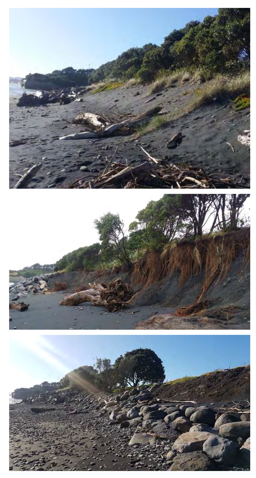
Photo 21 End effects from Urenui rip rap protection wall extension (top May 2015, middle June 2016, bottom May 2017)