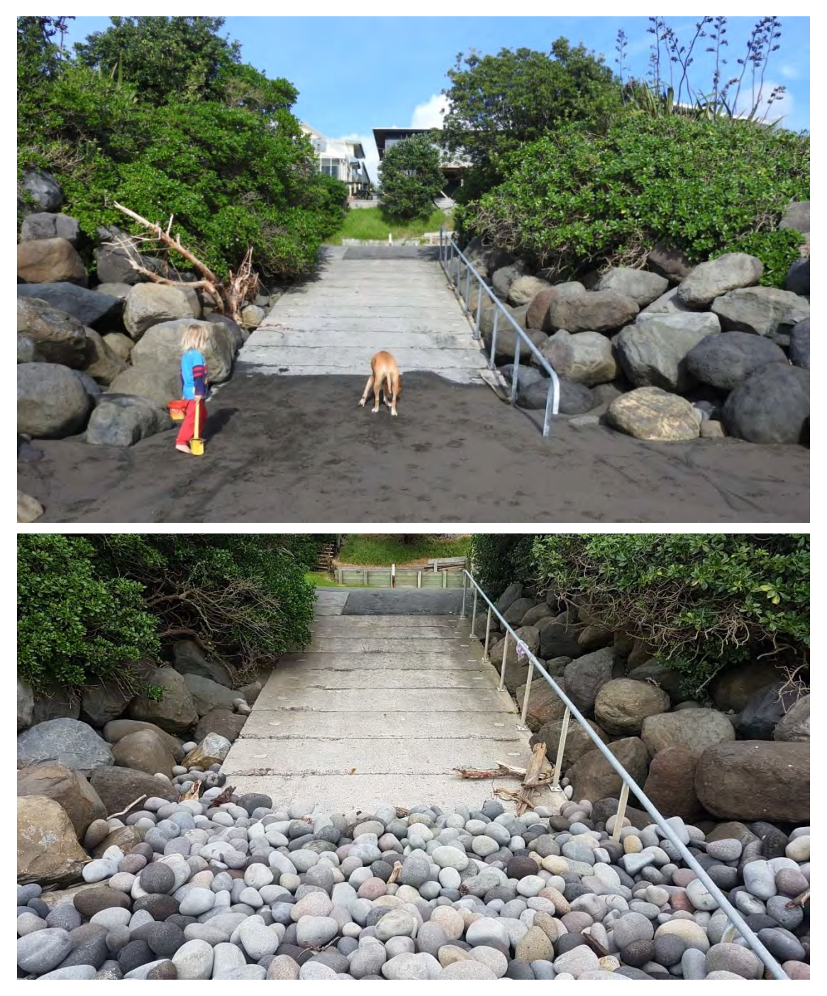
Photo 29 Bell Block access ramp to beach (top May 2016, bottom May 2017)