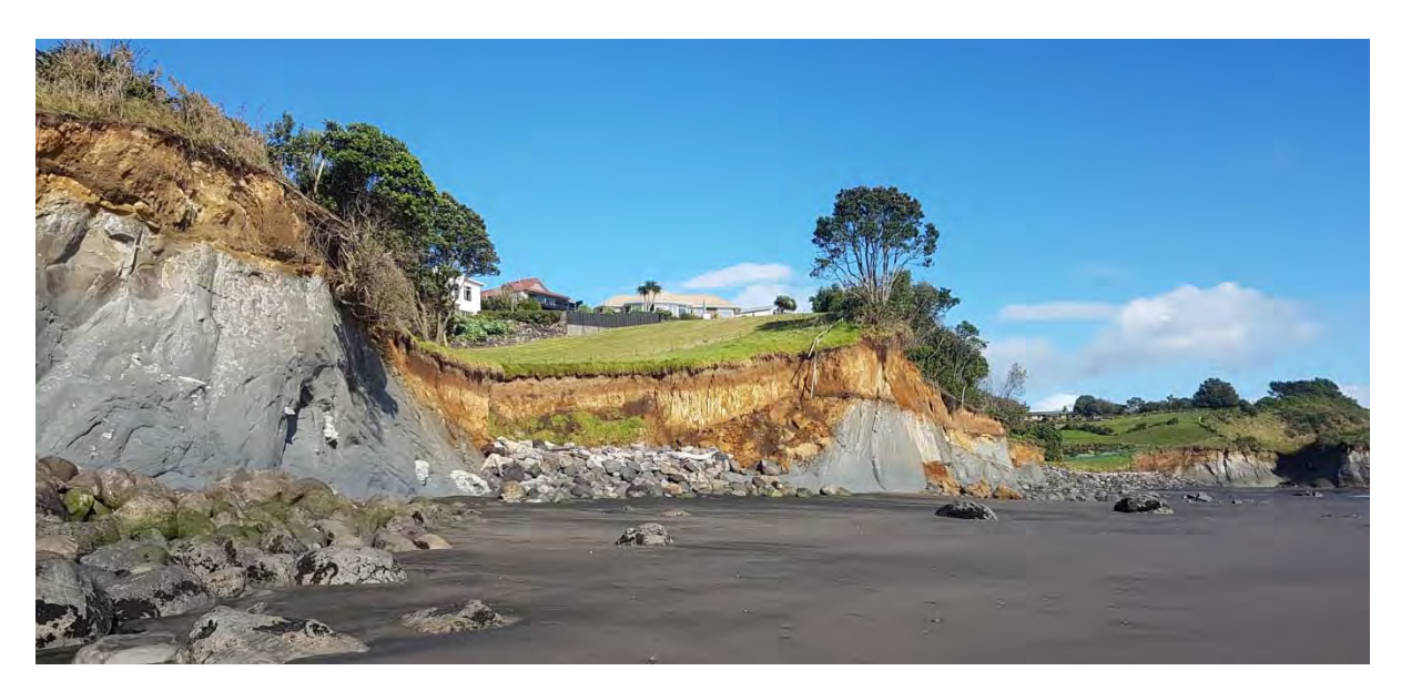
Photo 7 Eroding cliffs to the west of the seawall at Onaero (May 2017)