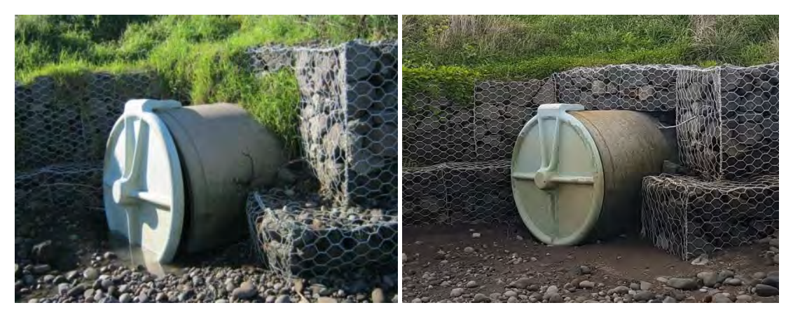
Photo 25 The stormwater outlet by the Atkinson Street/East Quay intersection (June 2013 and May 2017)

The groynes at the Waitara River mouth appeared satisfactory (permit 4600).