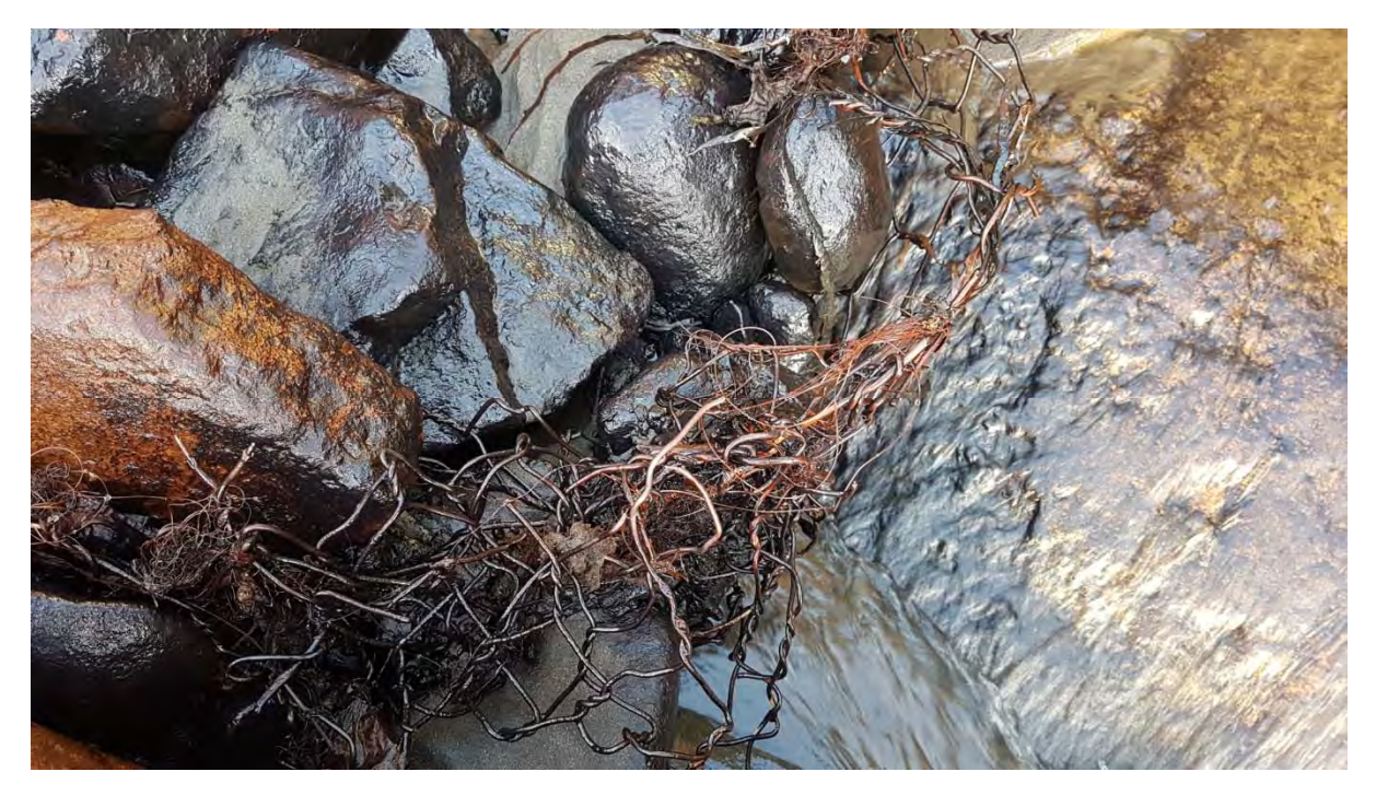
Photo 39 Outlet structure from the Hongihongi Stream showing to the left of the outlet were rusty and splitting gabion baskets (May 2017)