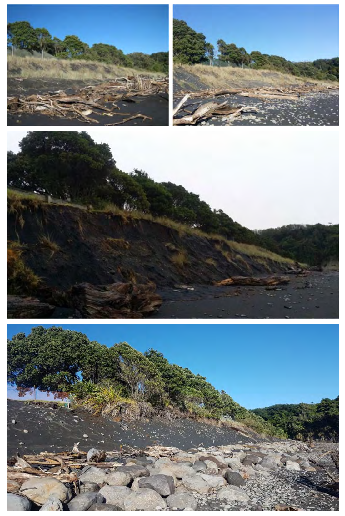
Photo 4 Sand push-up and dune restoration May 2014 and May 2015, major erosion June 2016, seawall extension May 2017

coastal erosion protection purposes. Construction began in September 2001 and was completed in December 2001.