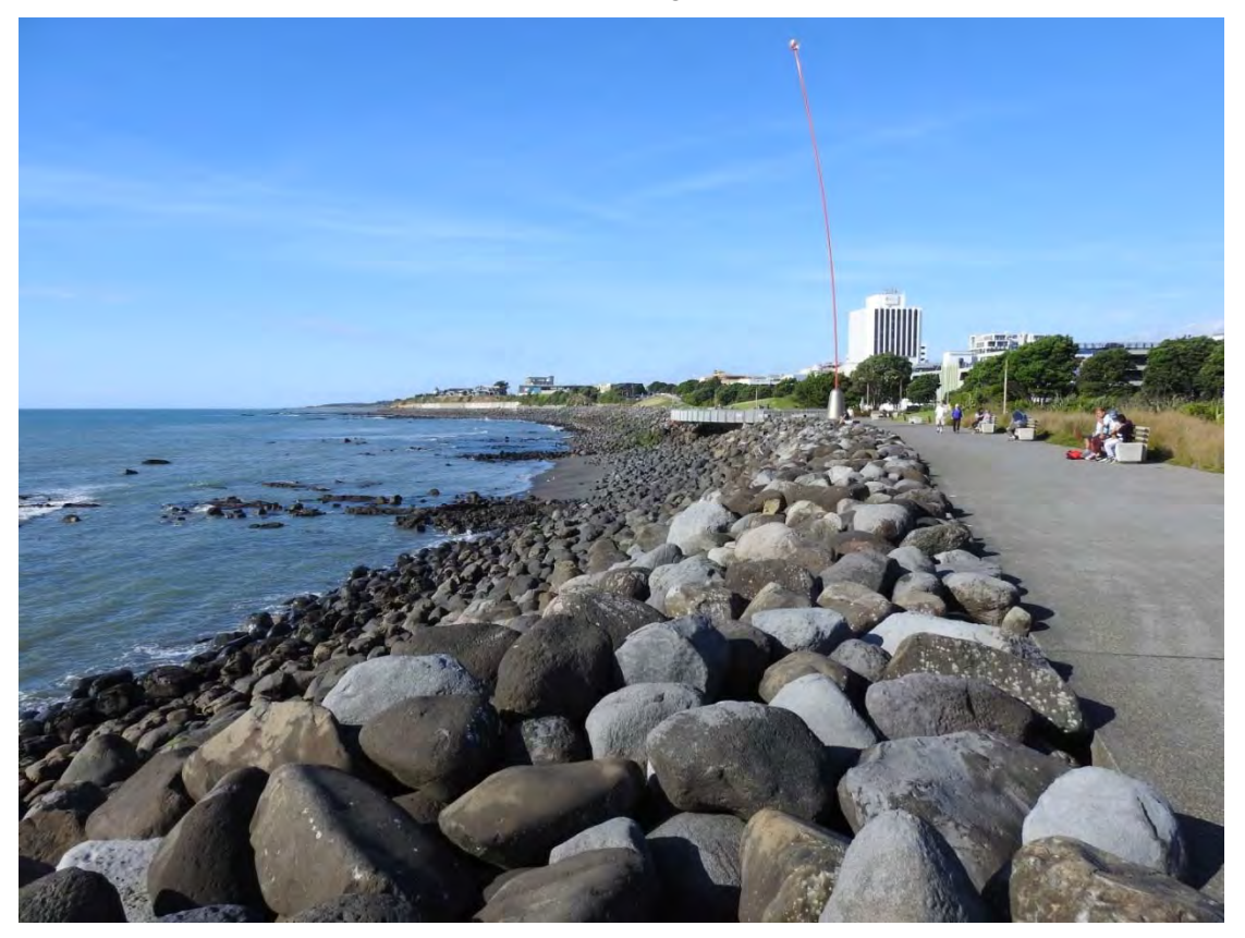
Photo 13 New Plymouth coastal walkway with rip rap seawall protection (April 2016)

In July 2001 the Council confirmed that NPDC proposed upgrades to the section of seawall between the Lee Breakwater and Belt Road would also be deemed as a permitted activity pursuant to Rule C1.1 of the RCP, provided the upgraded structure essentially remained within the general footprint of the existing structure. It was also recommended that the written agreement of Port Taranaki should be obtained.