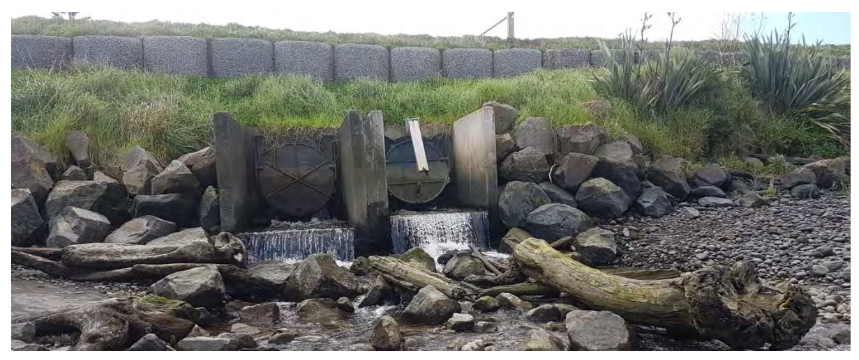
Photo 24 Stormwater outlet structure downstream of Atkinson Street (May 2017)

Coastal structures at Waitara were visited on 4 May 2017 in relation to five coastal permits. The stormwater outlet structure downstream of Atkinson Street (permit 4598) was in good condition and there was no evidence of erosion (Photo 24).