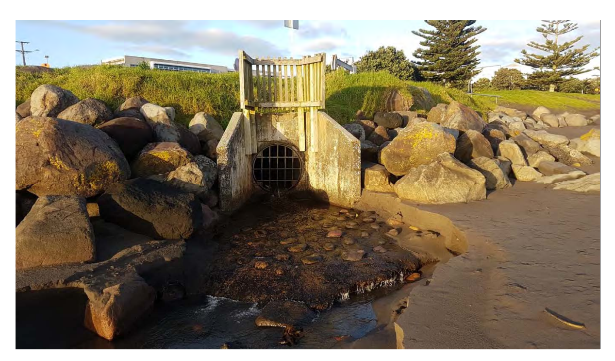
Photo 40 The Bayly Road stormwater outfall on Ngamotu Beach (May 2017)