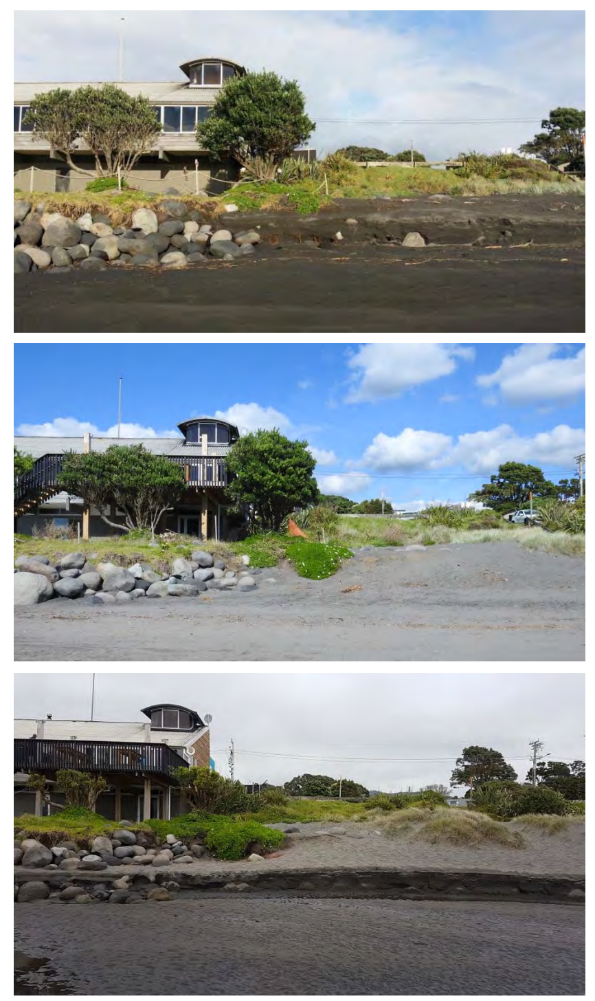
Photo 42 Protection works in front of Oakura Surf Life Saving Club showing erosion of the bank/dunes to the west of the club (top June 2015, middle April 2016, bottom May 2017)

Club (Photo 42). At the time of inspection sand build up had resulted in the Waimoku Stream cutting east across Oakura Beach, undercutting the base of the seawall down from the Surf Life Saving Club. The Waimoku Stream was been straightened on the day of inspection.