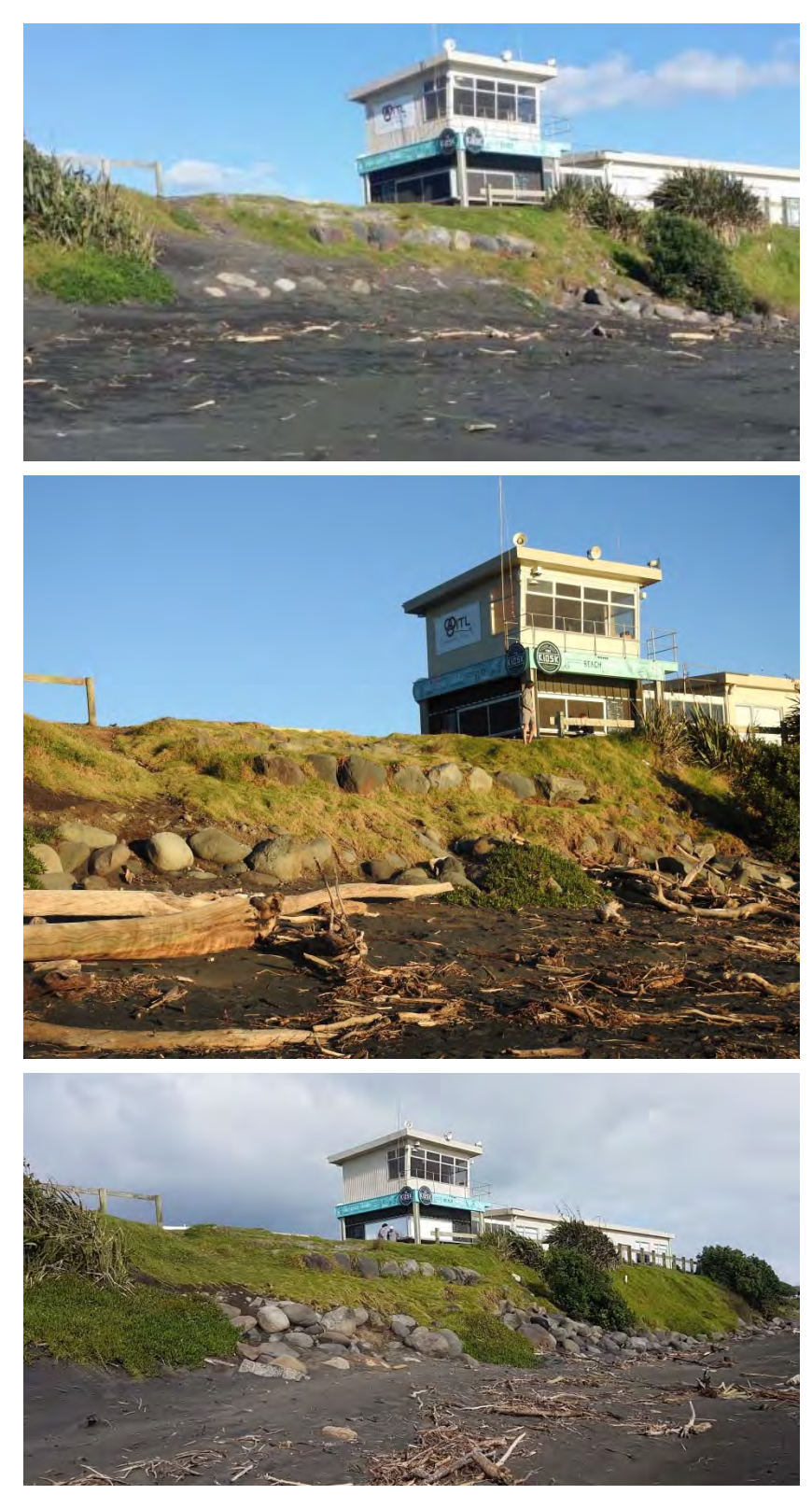
Photo 34 Rock protection works in front of Fitzroy Surf Lifesaving Club (top May 2015, middle June 2016, bottom May2017)