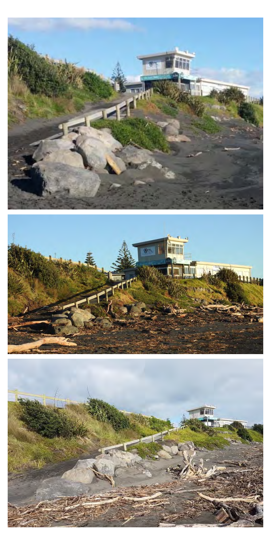
Photo 33 Boat ramp and rock protection works in front of Fitzroy Surf Lifesaving Club (top May 2015, middle June 2016, bottom May2017)