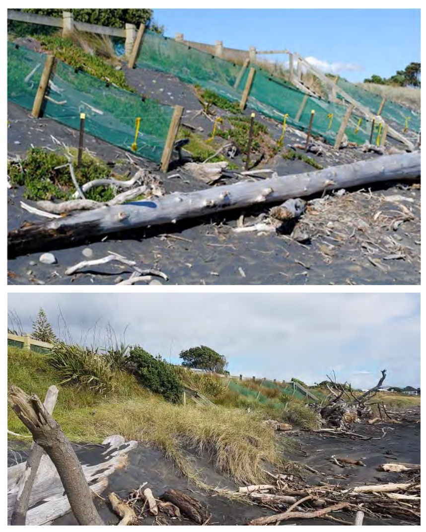
Photo 36 Plantings in front of the New Plymouth Surf Riders Club (April 2010 and May 2017)

The plantings in front of the New Plymouth Surf Riders Club have made major improvements in preventing erosion of the bank (Photo 36). The area is also well fenced.