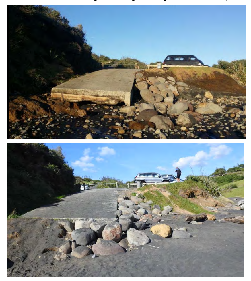
Photo 41 Boat ramp at Back Beach (top May 2015, bottom April 2016)

An inspection of the boat ramp was undertaken on 3 May 2017. The ramp remained in good condition with the erosion undercutting the ramp and banks notably less than previous years. The ramp was well embedded with surrounding rocks. A sign warning of erosion was in place.