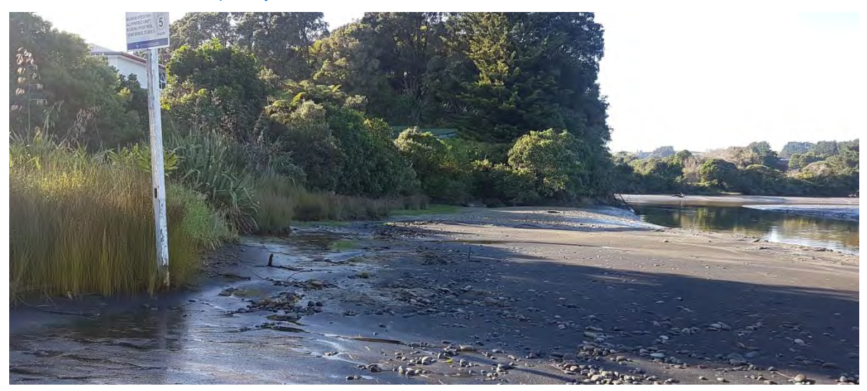
Photo 19 Riverbank protection works around the Manager's residence (May 2017) The rock rip rap seawall at the east of Urenui Beach (permit 5761) was in good condition.