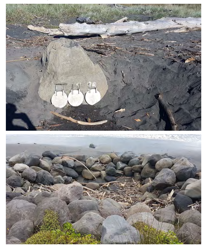
Photo 37 Stormwater outlets under coastal permit 4596 (top Fitzroy May 2017, bottom East End April 2017)

The rock rip rap protection on the right bank of the Te Henui Stream (permit 6242) appeared to be in good condition during the April 2017 inspection.