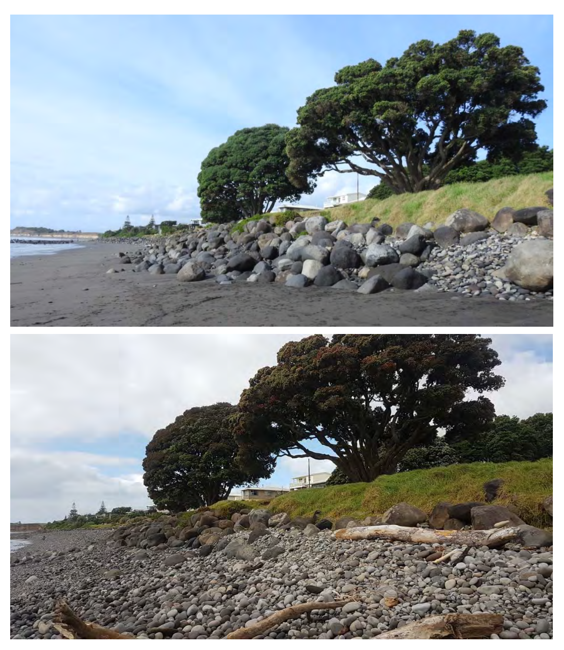
Photo 28 Bell Block seawall (May 2016 showing sandy beach, May 2017 showing cobble beach)