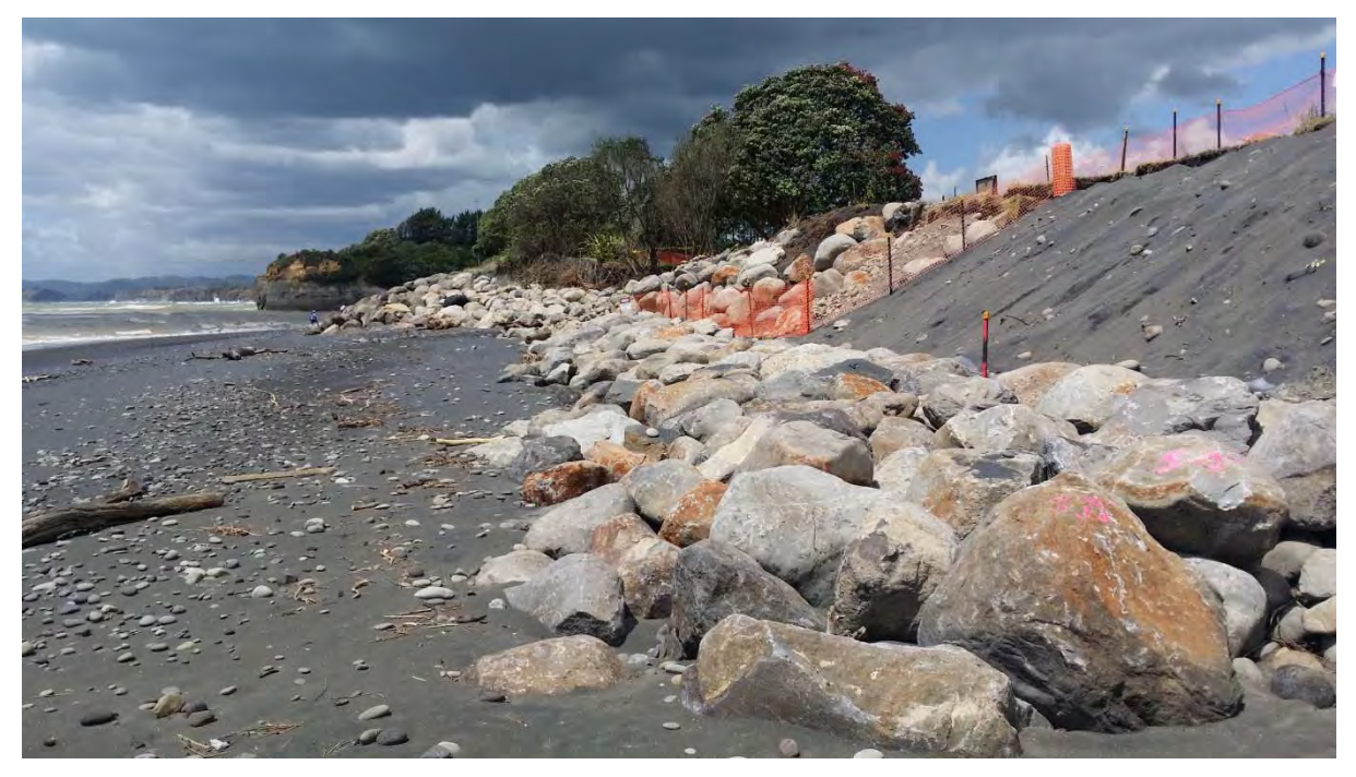
Photo 44 Construction of the seawall extension at Urenui Beach (December 2016)